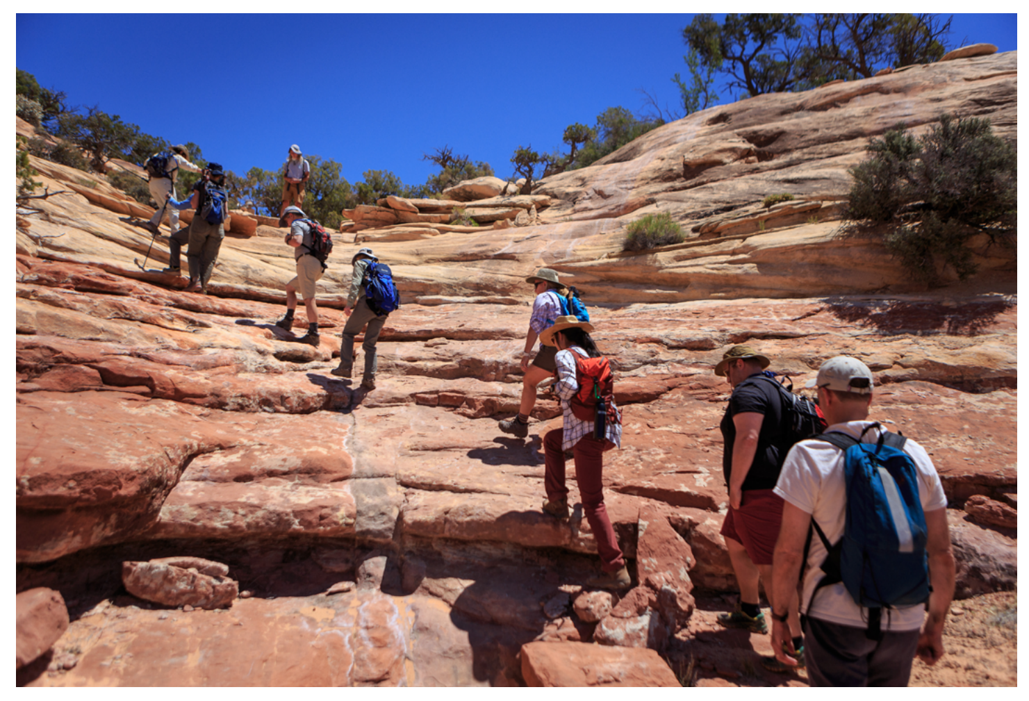
A 2018 donor trip to Bears Ears National Monument in Utah.