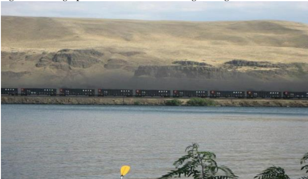
Figure 2. Photograph of Unit Coal Train Passing Through Columbia River Gorge.

First, railroads in California (and elsewhere, see Figure 2) parallel or cross many rivers and estuaries (Figure 1), which contain sensitive species and are lined with riparian corridors.