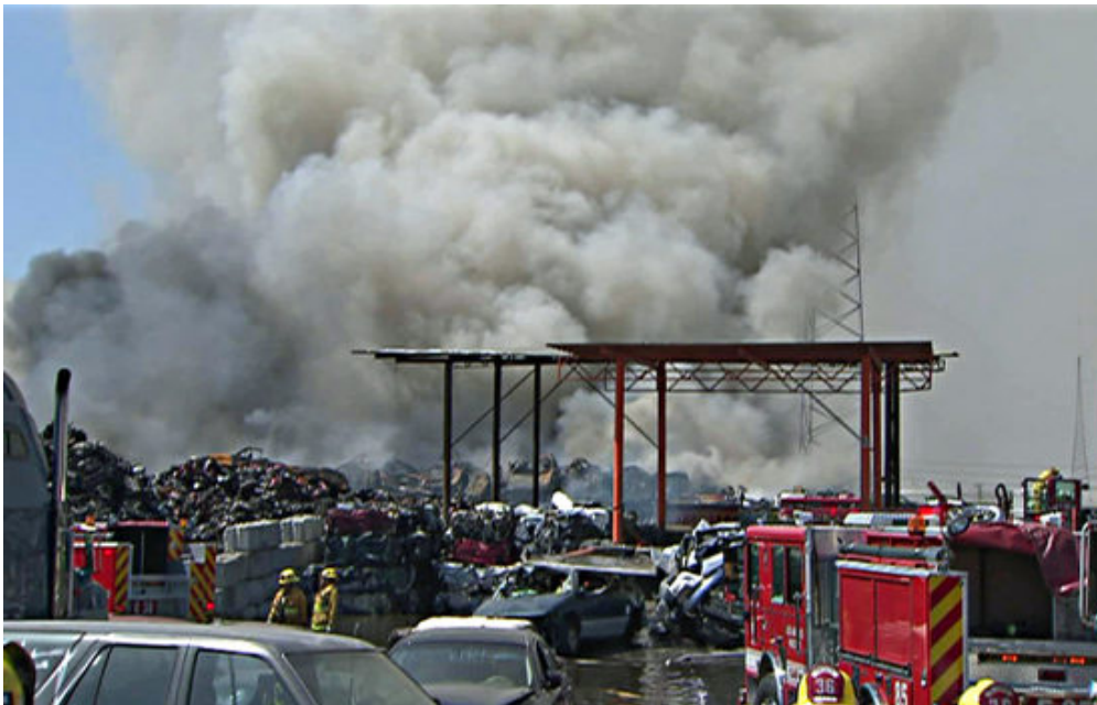
Fire at scrap yard in Wilmington