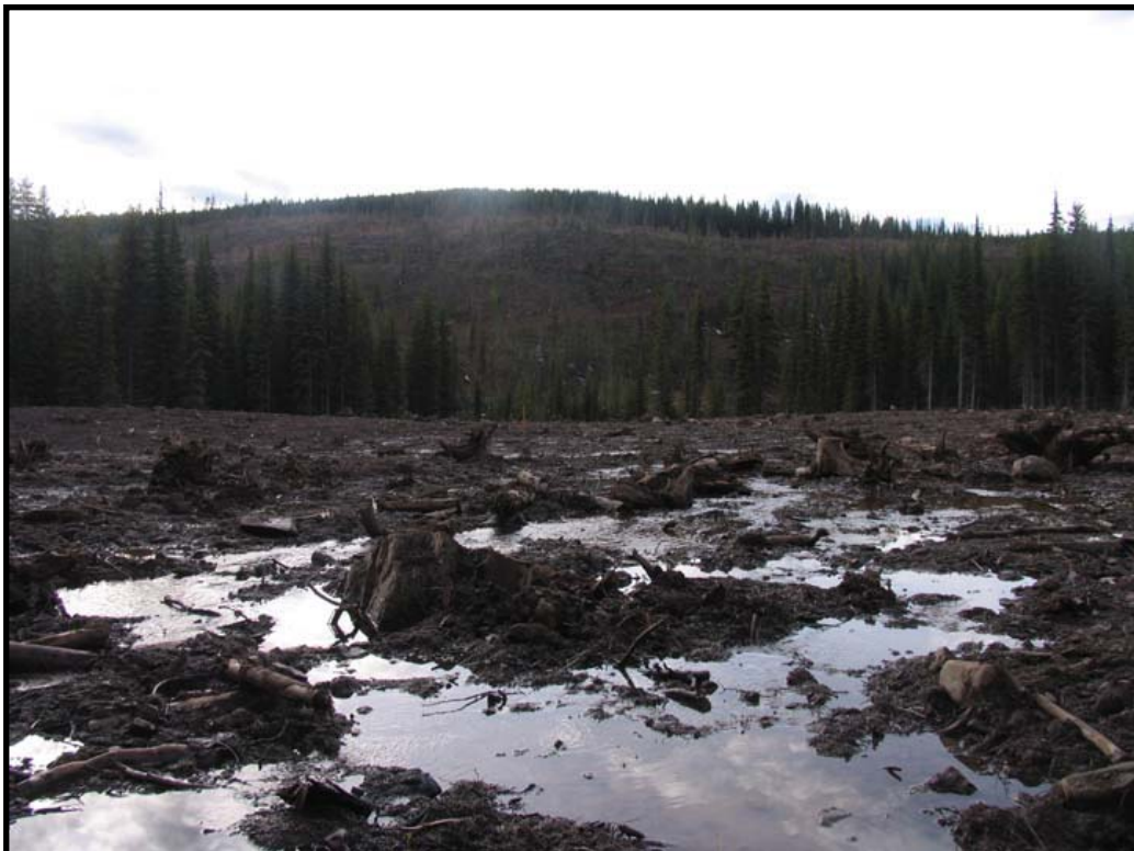
Photo 22. Abandoned Chevron Texaco exploratory well site, Elk Valley, British Columbia.