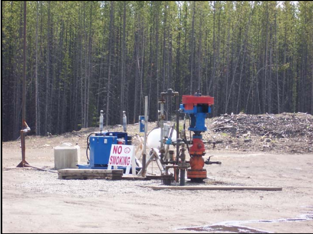
Photo 24. Encana/StormCat exploratory CBM well site.