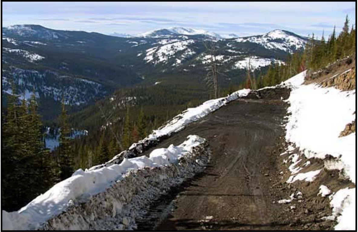
Photo 33. Hairpin switchback on climb towards Flathead Divide and the proposed Cline Mining Corp./Lodgepole open-pit coal mine, February 2005.