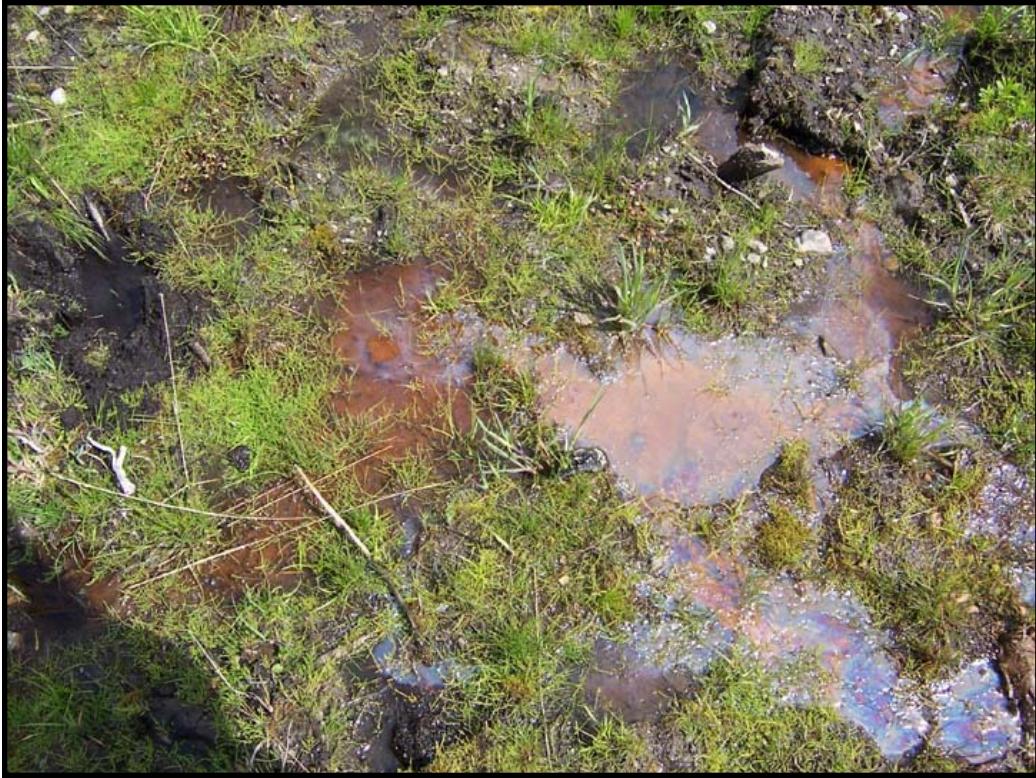
Photo 23. Encana/Storm Cat iron residues in surface disposal of CBM wastewater.