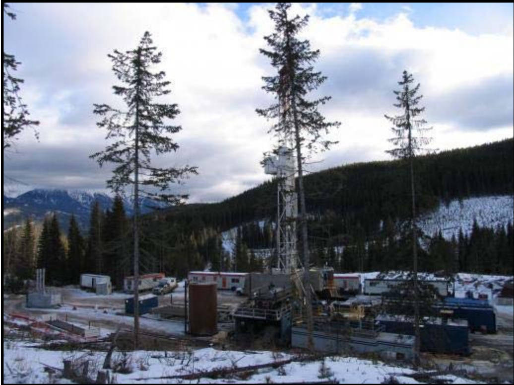
Photo 6. Shell coalbed methane exploratory well site, Wheeler Creek, Elk Valley, British Columbia, December 2004.