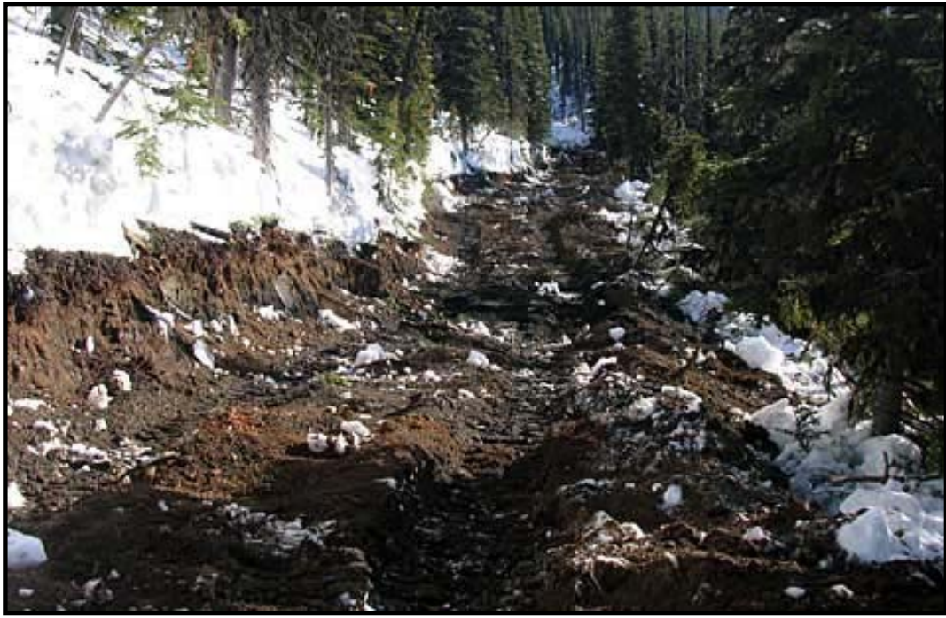
Photo 31. Cline Mining Corporation bulldozed a seven kilometer road in the Foisey Creek drainage, headwaters of the Flathead, in February 2005.