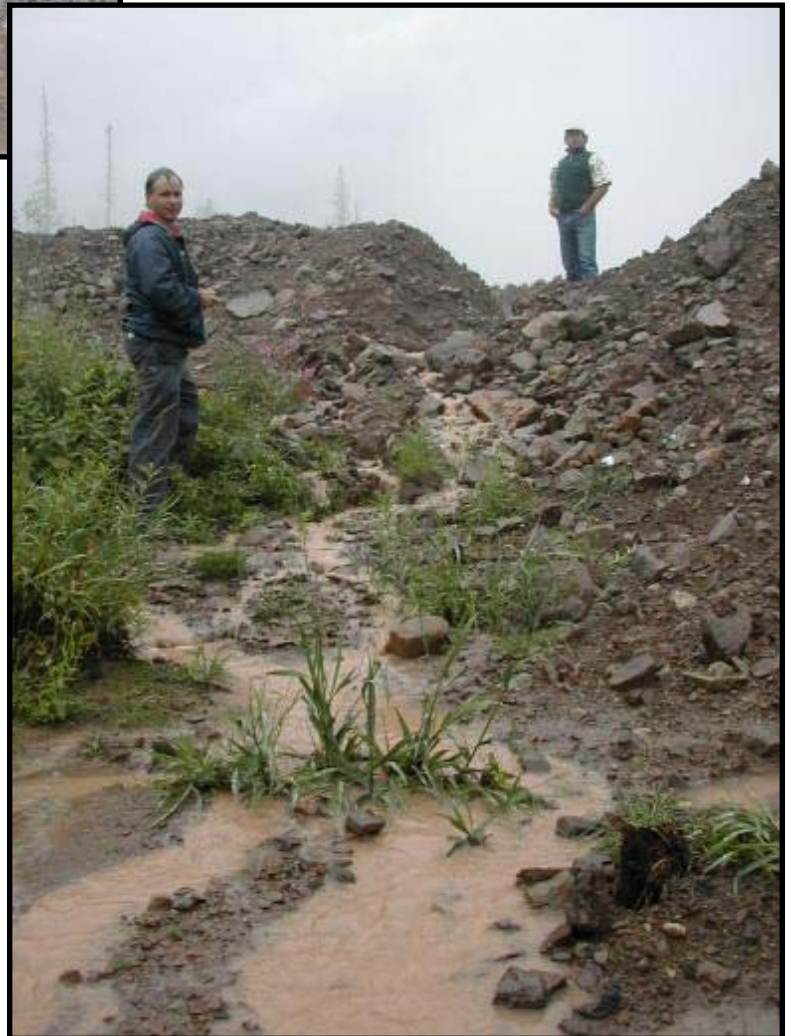
Photo 14 (right). Sediment-laden run-off from Chevron Texaco abandoned coalbed methane exploratory well site, Elk Valley, British Columbia, 2003.