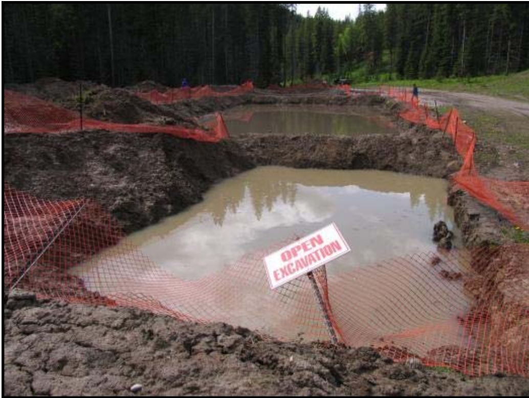
Photo 17. Unlined waste pit, Shell coalbed methane exploratory well site, Elk Valley, British Columbia.