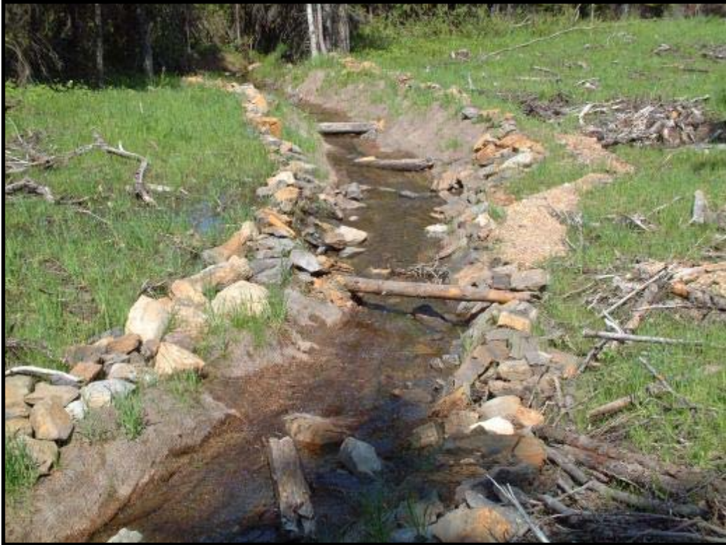
Photo 9. Surface disposal of CBM wastewater draining to Elk River, Encana/StormCat coalbed methane pilot project, 2004, Elk Valley, British Columbia