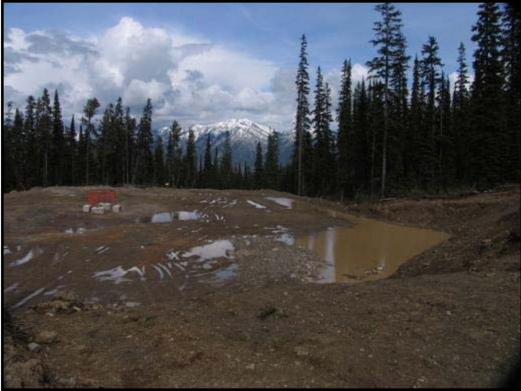
Photo 5. Shell coalbed methane exploratory well site, Wheeler Creek, Elk Valley, British Columbia, June 2006.