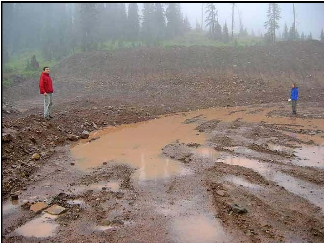
Photo 18. Chevron Texaco abandoned coalbed methane exploratory well site, Elk Valley, British Columbia.