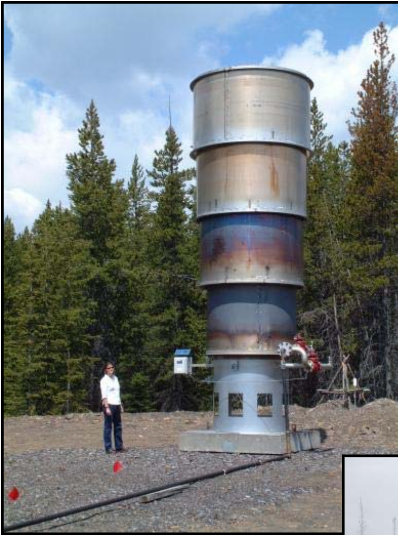
Photo 13 (above). Encana/StormCat CBM gas flaring equipment, Elk Valley, British Columbia.