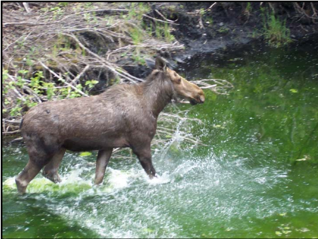
Photo 26. Cow moose in Coal Creek, Elk Valley.