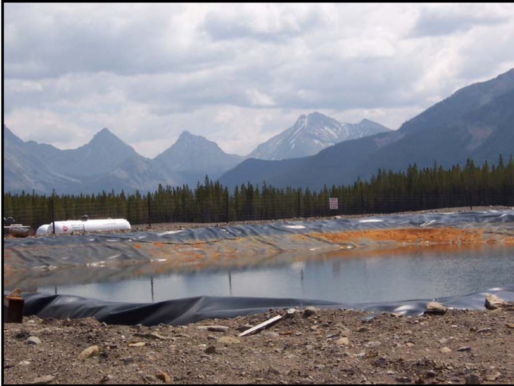
Photo 25. Encana/StormCat wastewater settling ponds, exploratory CBM well site.