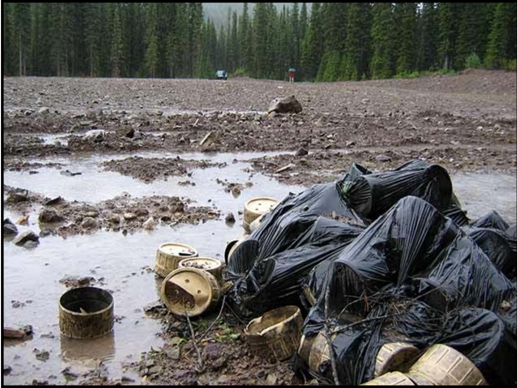
Photo 1. Chevron Texaco abandoned coalbed methane exploratory well site, Coal Creek, Elk Valley, British Columbia, June 2004.