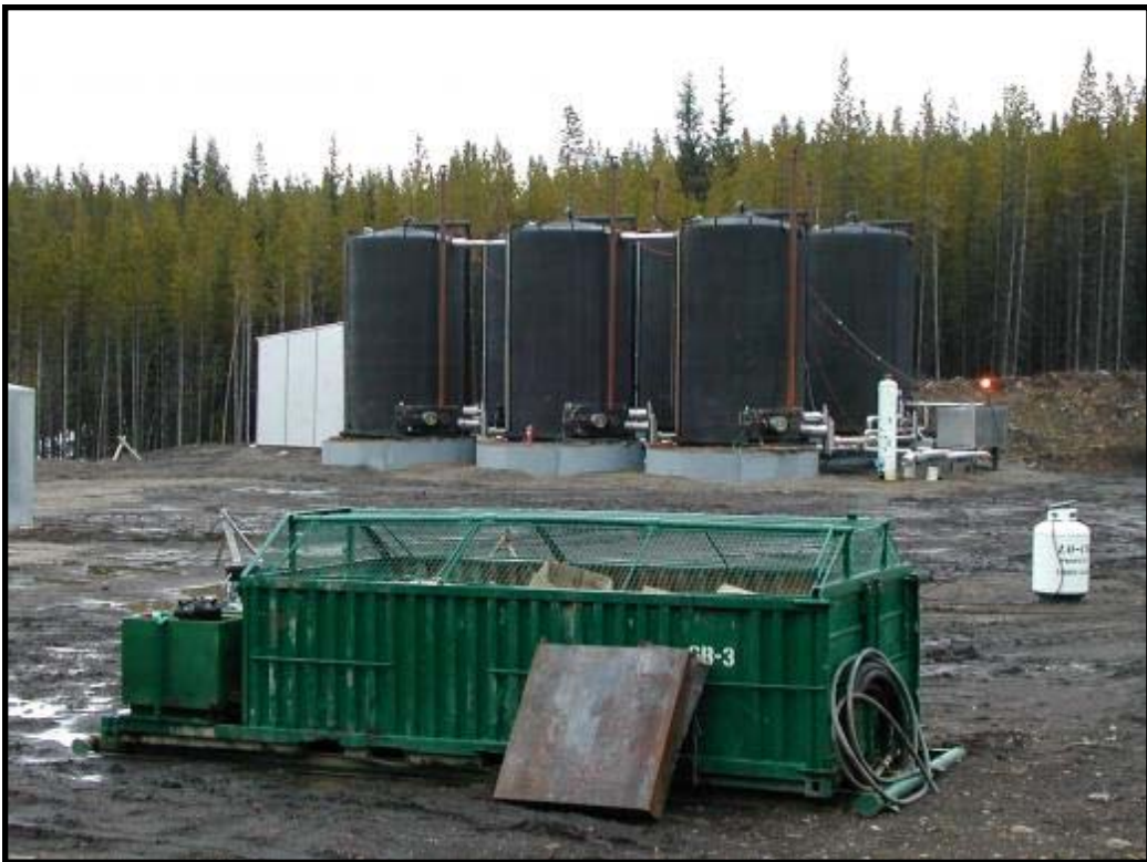
Photo 8. Encana/StormCat coalbed methane pilot project, 2004, Elk Valley, British Columbia.