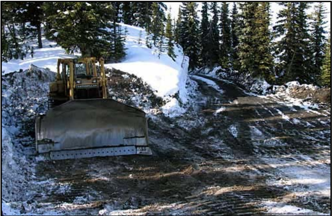
Photo 32. The road to the Flathead Divide and the proposed Cline Mining Corp./Lodgepole open-pit coal mine, February 2005.