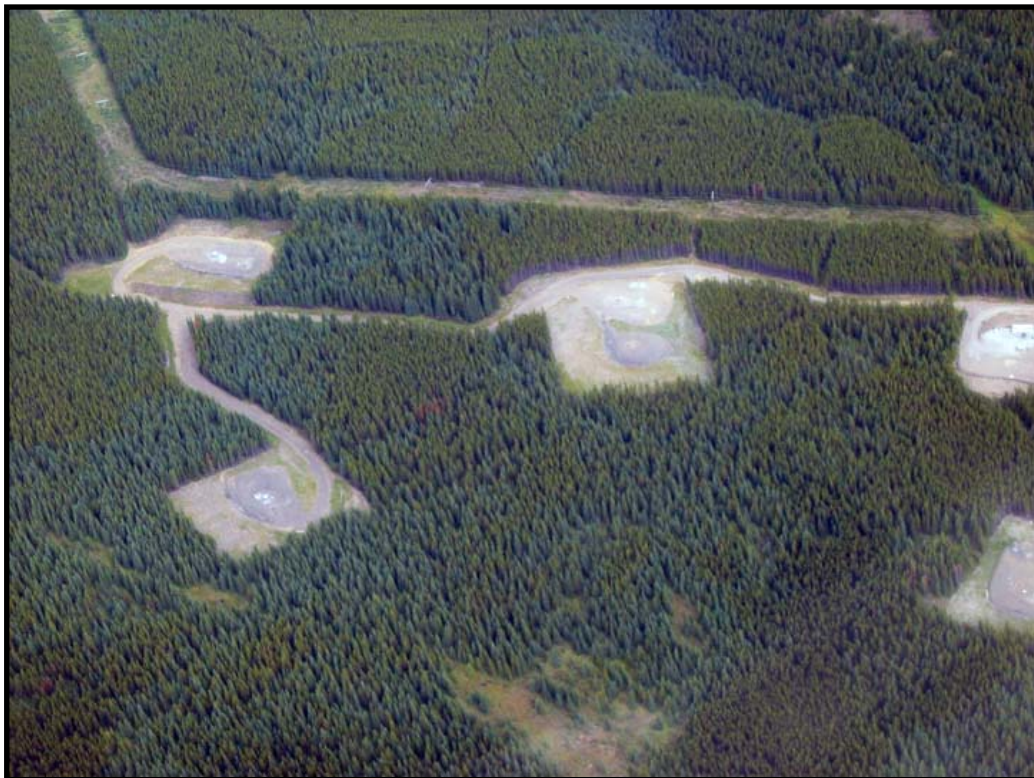
Photo 28. Encana/StormCat exploratory CBM well sites.