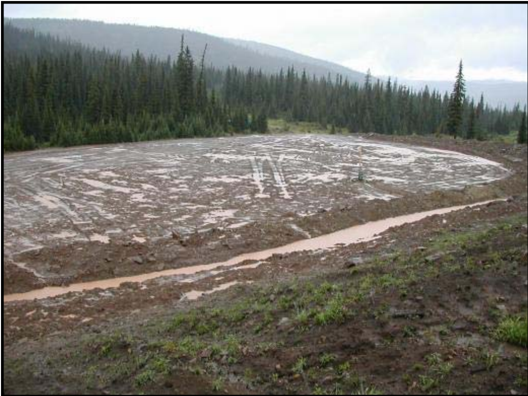
Photo 2. Chevron Texaco abandoned coalbed methane exploratory well site, Matheson Creek, Elk Valley, British Columbia, 2004.