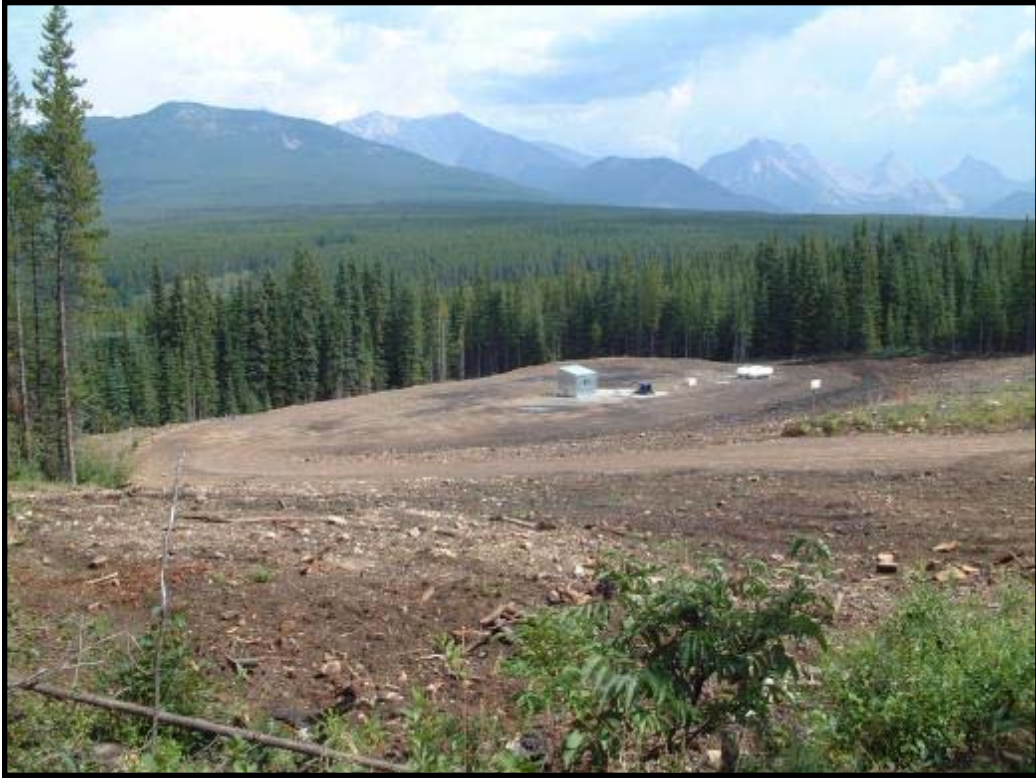
Photo 3. Encana/StormCat coalbed methane exploratory well site, Elk Valley, British Columbia.