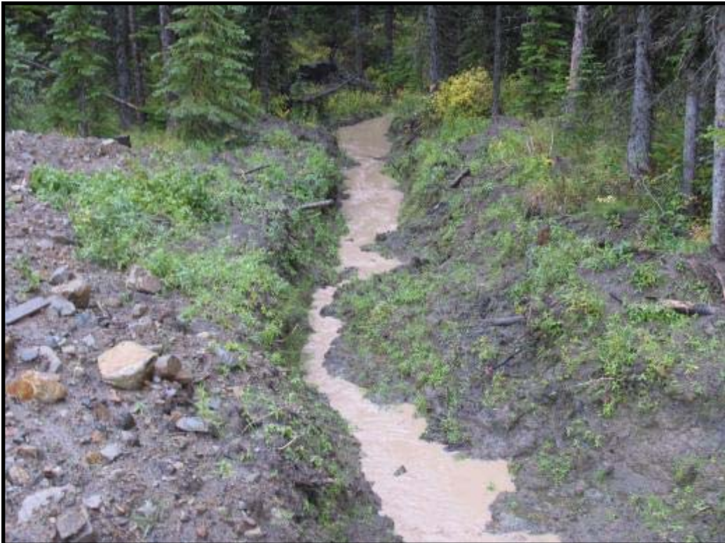
Photo 10. Sediment-laden run-off from Chevron Texaco abandoned coalbed methane exploratory well site, 2003, Elk Valley, British Columbia.