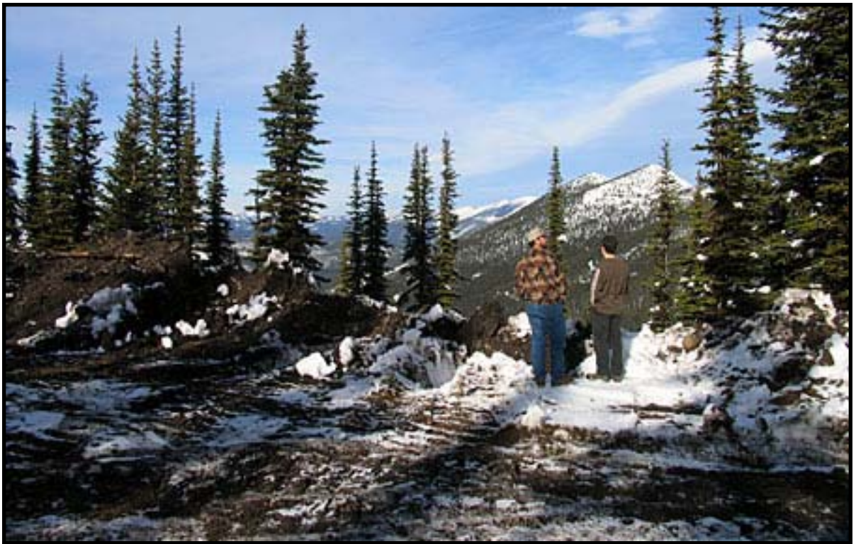
Photo 34. View from the height of Foisey Creek drainage, proposed site of Cline Mining Corp./Lodgepole open-pit coal mine, into the Flathead watershed, February 2005.