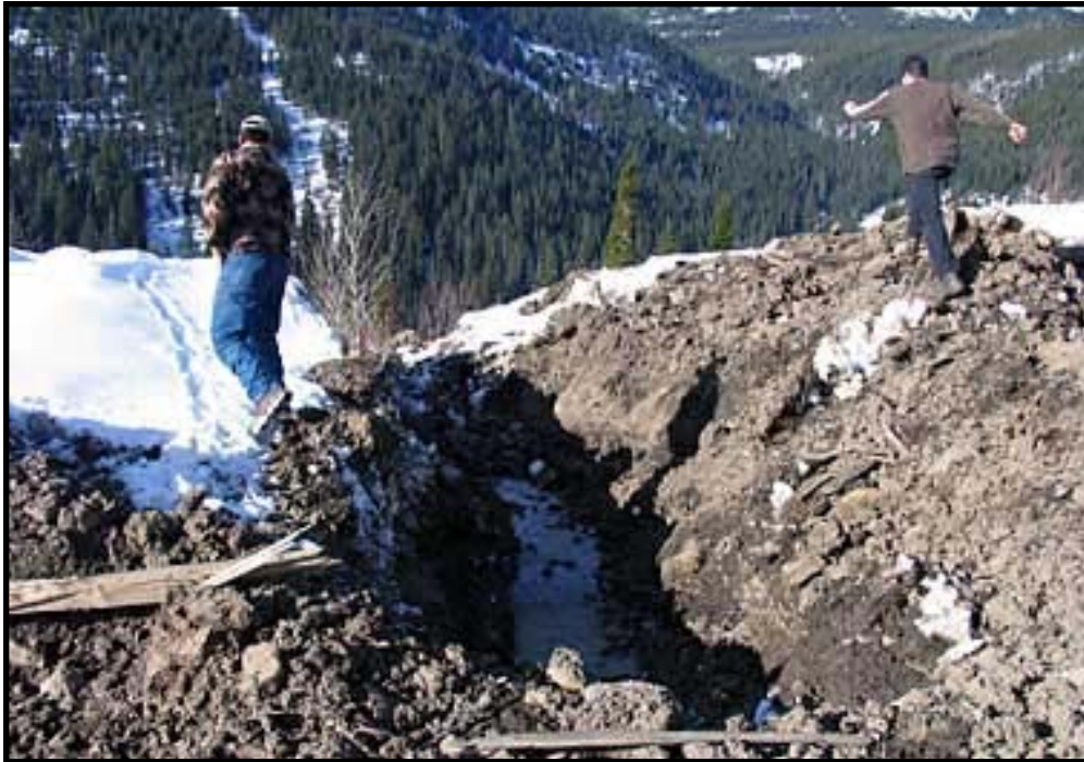
Photo 36. Mud drains from raw Cline culvert towards North Fork of Lodgepole Creek, February 2005.