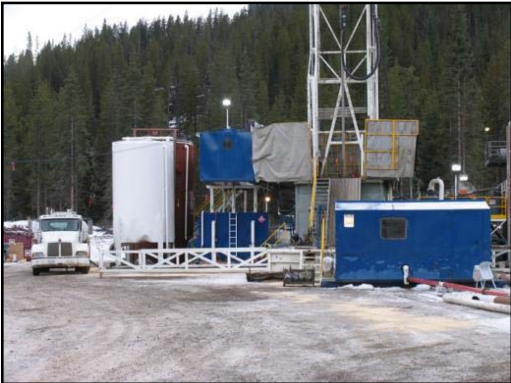
Photo 12. Shell coalbed methane exploratory well site, Elk Valley, British Columbia.