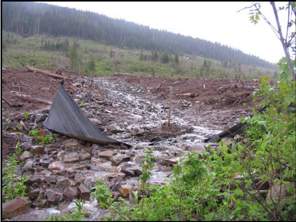
Photo 19. Abandoned Chevron Texaco exploratory well site, Elk Valley, British Columbia.