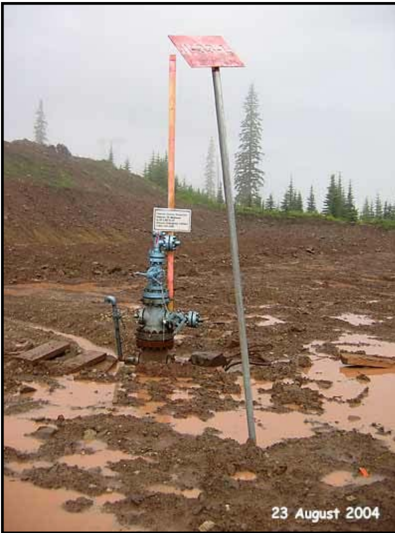
Photo 15 (above). Coalbed methane exploratory well site, Elk Valley, British Columbia.