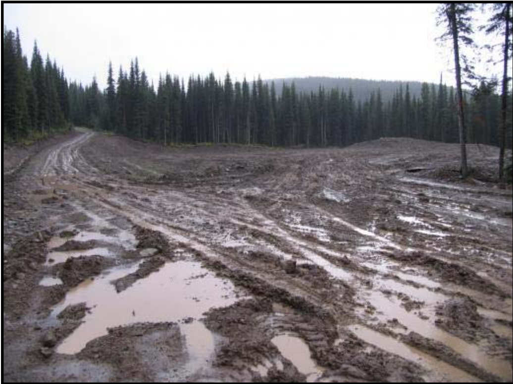
Photo 4. Chevron Texaco abandoned coalbed methane exploratory well site, Elk Valley, British Columbia.