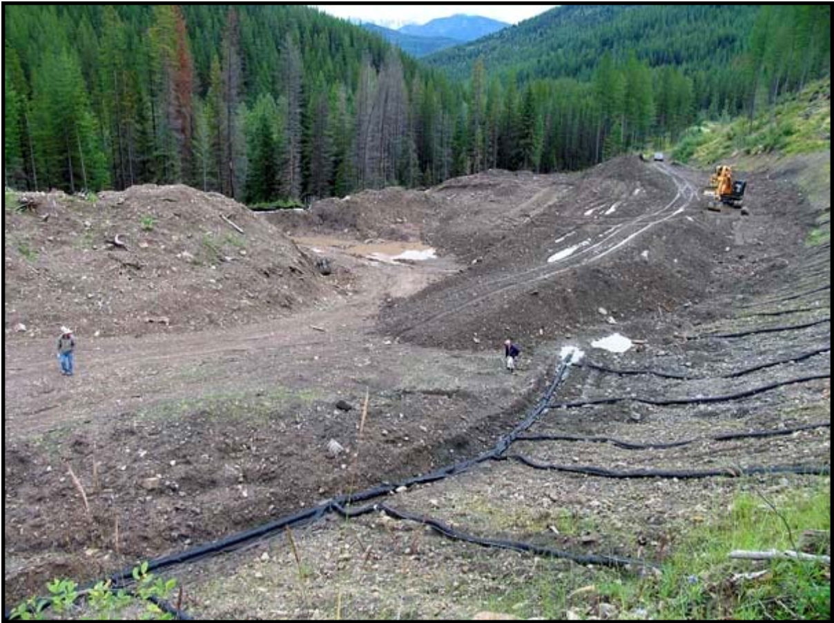
Photo 21. Shell Canada Ltd.'s Wheel Creek coalbed methane site, collapsed and slumped into Wheeler Creek in heavy rains, southeast British Columbia.