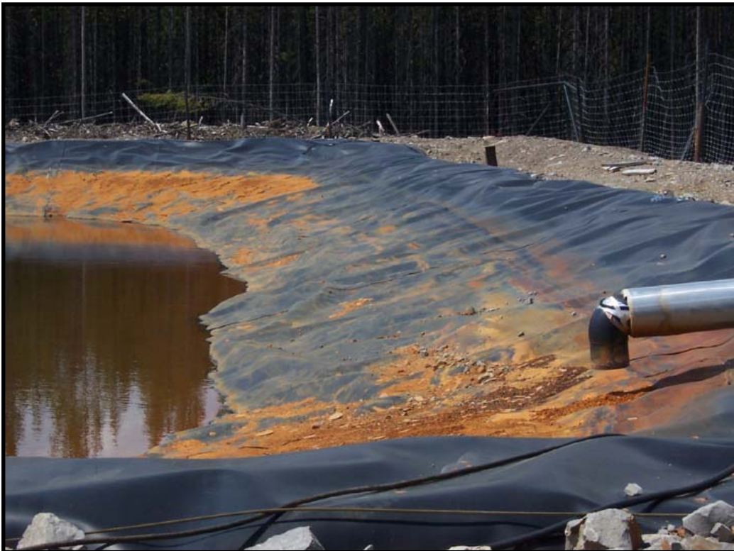
Photo 20. Iron deposits at an Encana/StormCat CBM wastewater settling pond, Elk Valley, British Columbia.