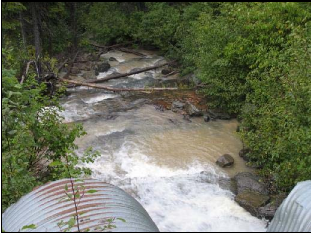
Photo 11. Sediment-laden run-off from Chevron Texaco abandoned coalbed methane exploratory well site, 2003, Elk Valley, British Columbia.