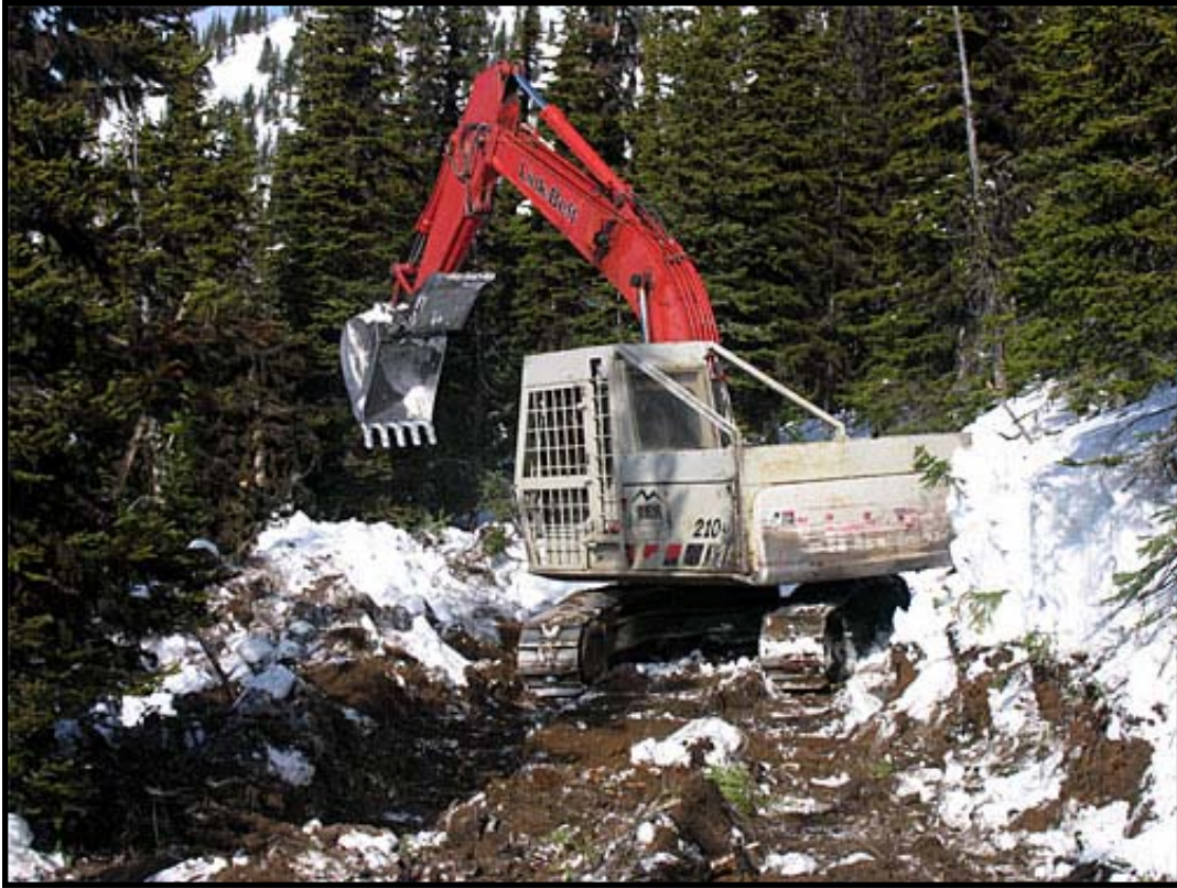
Photo 35. Cline Mining roadbuilding in the Foisey Creek drainage, February 2005.