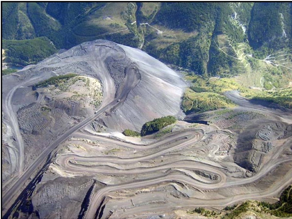
Photos 37 & 38. An open-pit coal mine in Southeastern British Columbia. Available at: http://www.em.gov.bc.ca/Mining/Geolsurv/Publications/expl_bc/1998/ex98sc.htm .