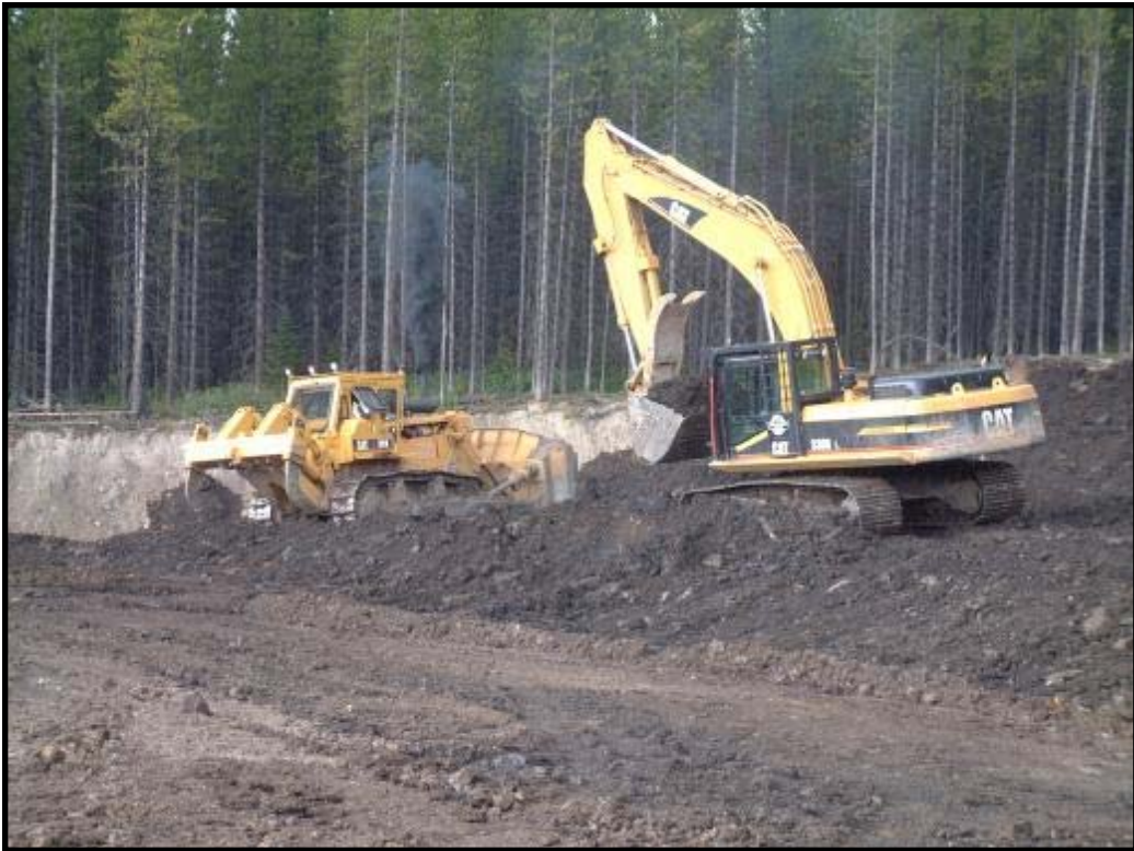
Photo 7. Encana/StormCat coalbed methane pilot project, 2004, Elk Valley, British Columbia. From Citizens Concerned About Coalbed Methane.