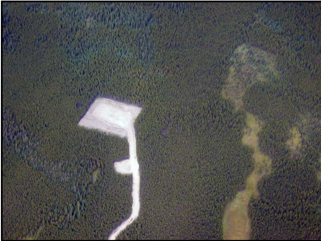
Photo 27. Encana/StormCat exploratory CBM well site.