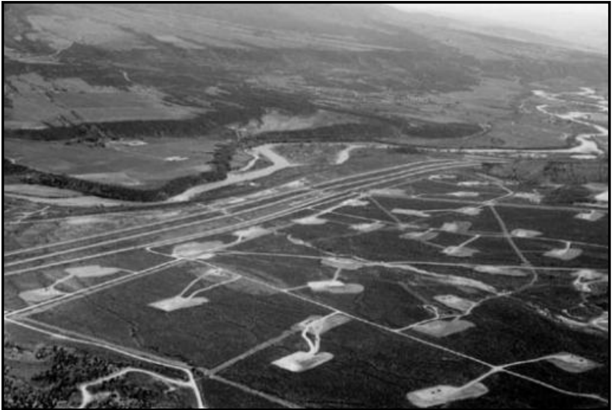
Photo 29. A typically dense network of CBM well sites in the U.S..