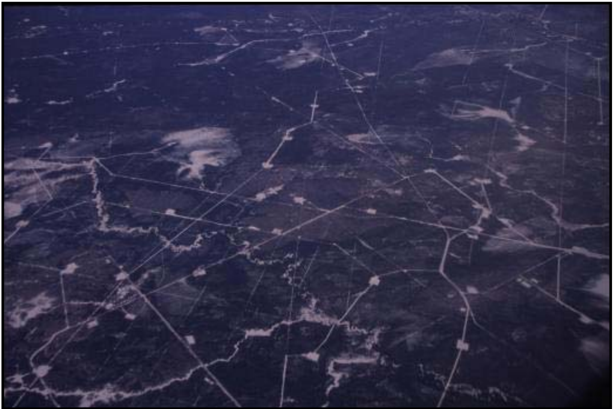
Photo 30. A typically dense network of CBM well sites in the U.S..