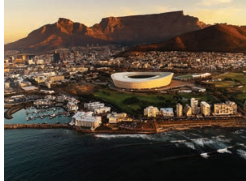
Aerial view of Cape Town, South Africa

To expand access to the benefits of clean energy, Earthjustice is working alongside our partners to grow community solar state by state. Community solar projects allow households that can't install rooftop panels themselves to subscribe to a solar installation in their community and receive credit on their utility bill for their share of the power produced. It's an important way to make the benefits of solar available for all. We are advocating passage of community-solar enabling legislation in Pennsylvania, Florida, and New Mexico, and working to ensure that pilot community solar programs we helped launch in Maryland, New Jersey, New Orleans, and Hawai'i succeed.