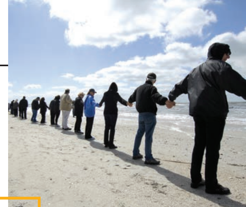
Demonstrators join hands on St. Pete Beach in Florida to oppose offshore oil drilling.

Act, but the Trump administration and the County of Maui argue that the act has no jurisdiction over pollution that is added to our nation's waterways via groundwater. The stakes are high: The Supreme Court's ruling could either uphold or gravely weaken the act's power to rein in water pollution from all manner of industrial facilities.