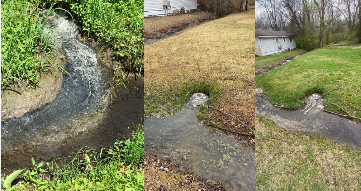
Figures 1-3: Dry weather sanitary sewer overflow at North 82 nd Street in Centreville, Illinois on June 26, 2019; January 26, 2021, and March 30, 2021, respectively, from left to right.

Sewage discharges have been occurring at the North 82 nd Street location for many years prior to the last five years, and Commonfields has known about the fountain of sewage since at least 2010. For example, on July 26, 2010, the Illinois EPA documented a complaint regarding the above-mentioned ongoing sewage overflow at North 82 nd Street, which it described, at the time, as “occurring periodically over the past 2-3 years.” 40 The Illinois EPA collected a water sample from the ditch between the two homes where this discharge flows, and the water sample notes indicate a “high flow rate.” 41 The Illinois EPA also contacted Commonfields, which was aware of the discharge. 42