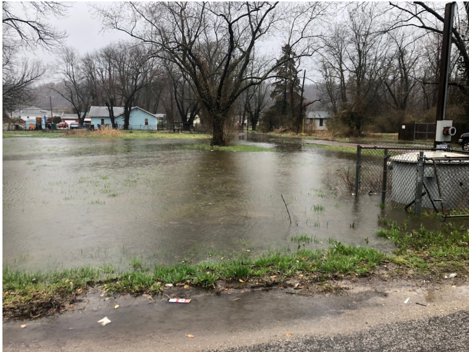
Figure 8: Lift station at North 82 nd Street and Bluff Street in Centreville, Illinois during a flood on March 30, 2019.

206. One of Commonfields' failing lift stations is located at North 82 nd Street and Bluff Avenue. When the U.S. EPA inspected this station on January 26, 2021, the electrical panel was uncovered, indicating poor maintenance. Until recently, Commonfields operated this lift station manually. On information and belief, the manual operation of this lift station involves the dispatch of maintenance staff approximately three (3) times per week to pump sewage water to a higher elevation. Unsurprisingly, this lift station floods chronically and has a history of operations and maintenance issues dating back to at least a decade ago. (See Figure 8). For example, in March of 2011, when one resident had been experiencing sewage backups for approximately a week, Commonfields discovered that this lift station had failed.