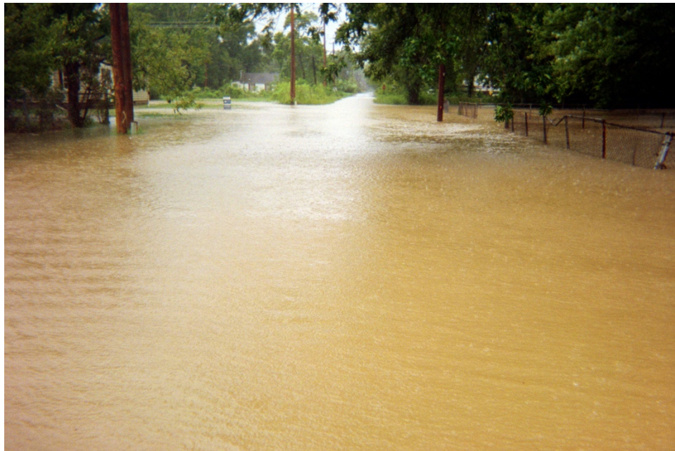
Figure 2: Flooding on [REDACTED] in September 2018.

32. During rain events, the water in the neighborhood can get as high as two (2) feet and brings with it not only the smell of sewage, but fish, such as carp, that are believed to come from the nearby Frank Holten State Park. When the water is as high (or higher) than two (2) feet, Mr. Byrd, his family, and surrounding neighbors are unable to leave their respective homes until the stormwater recedes. Mr. Byrd owns a boat that he keeps on his property to rescue his family and neighbors should they need to leave the area when the water gets too high. It can take several hours for water to recede and three (3) to four (4) weeks for water in ditches to go down if there is no rain in the interim. (See Figure 2)