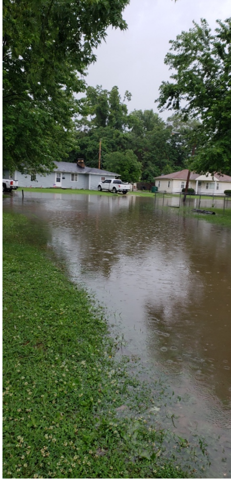
Figure 7: Flooding in Piat Place in front of [REDACTED] on June 30, 2020.