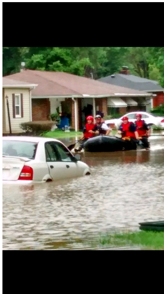
Figure 6: Boat rescue on [REDACTED] during flooding on or about September 2018.