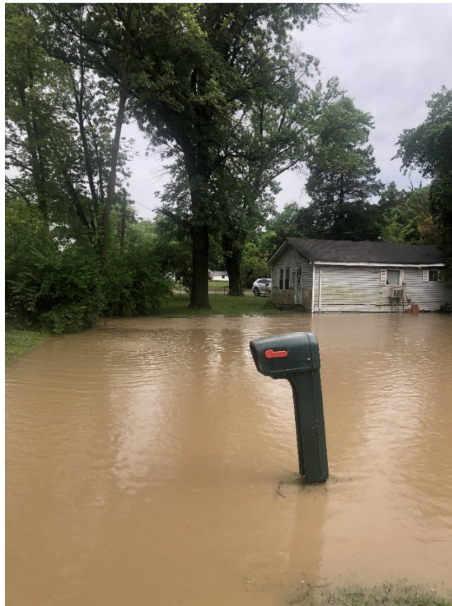
Figure 5: Flooding near [REDACTED] on June 30, 2020.

51. Mr. McNeal estimates he has encountered two (2) to three (3) stormwater flood events per year since the late 1990s to date, with the most recent occurring on or about May 2021. (See, e.g., Figure 5).