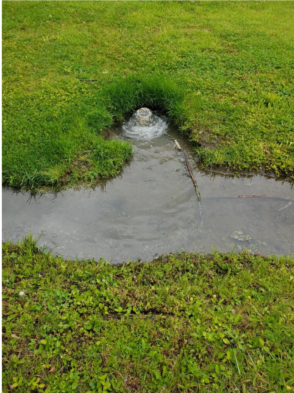
Figure 14: North 82 nd Street SSO in Centreville, Illinois on April 24, 2021.