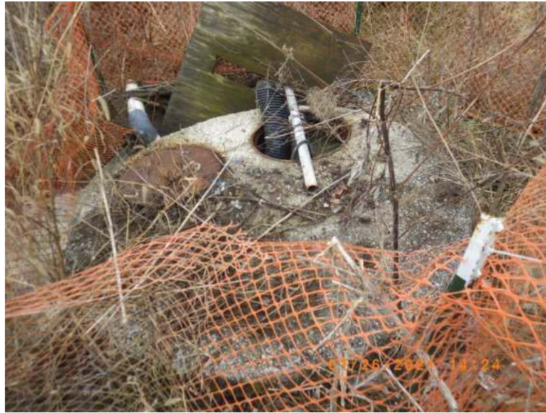
Figure 13: Sanitary Sewer Overflow on January 26, 2021, at lift station at Lauralee Drive and Violet Drive in Centreville, Illinois.

The resulting discharges accumulate as ponded water next to the lift station.