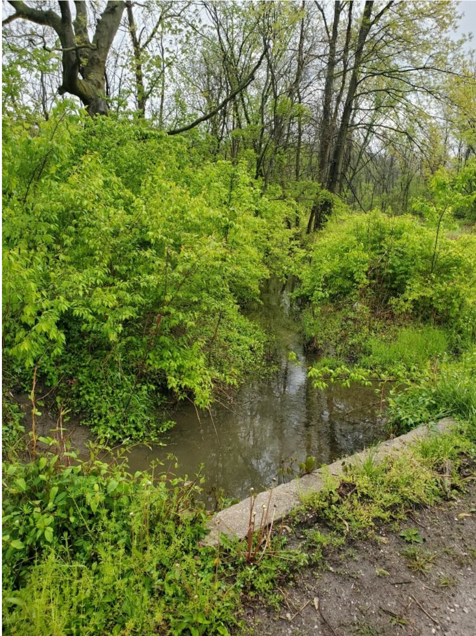
Figure 15: Flow of sewage discharge that originated at the North 82 nd Street SSO in Centreville, Illinois on April 24, 2021.