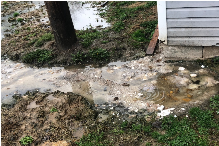
Figure 1: Sewage at Mr. Byrd's residence in March 2019.

30. Specifically, during both dry and rainy weather, the Defendants' defunct sanitary sewer systems have resulted in the inability to flush and/or use the toilets in Mr. Byrd's home, creating sewer backups in and outside of the home, and near his front door and side yard where human waste, feces, urine, and toilet paper exit his home and remain stagnant. (See Figure 1).