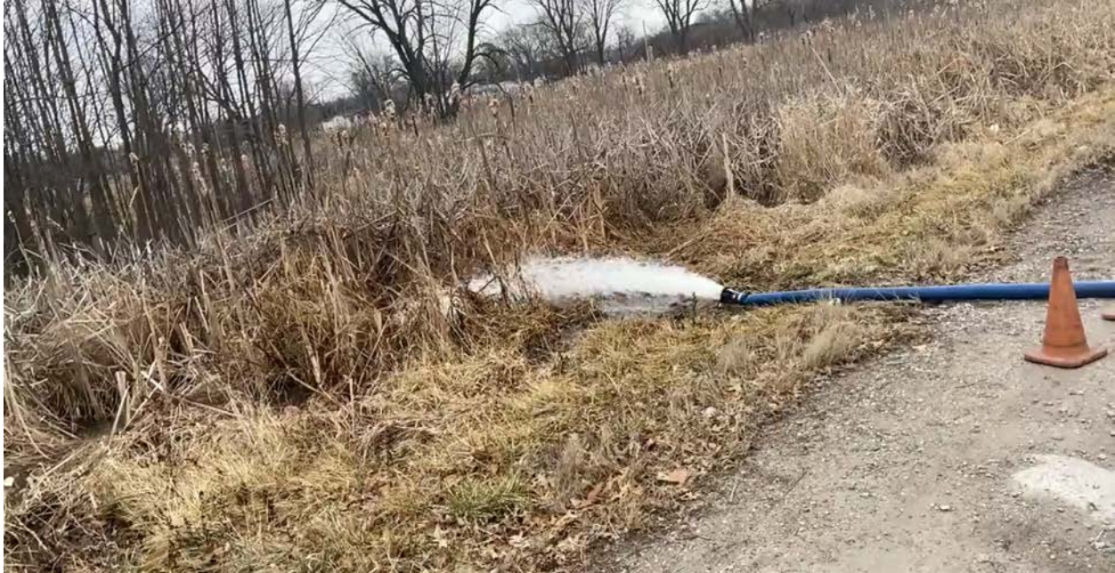
Figure 16: Pumping of stormwater by City of Centreville personnel from a sewer lift station near 56 th Street and Central Avenue to a wetland next to a residential area in Centreville, Illinois on February 1, 2021.

246. Cahokia Heights' sewage system has severe inflow and infiltration problems. For example, in April 2019, the Illinois EPA noted that a Village of Cahokia stormwater retention pond was continuously overflowing its bank and that the stormwater infiltrates nearby manholes. In April 2021, during a U.S. EPA inspection, the Village of Cahokia Water and Sewer Department foreman noted that chronic backups near a particular sewer lift station were due to poor stormwater drainage during rain events exceeding two (2) to three (3) inches, and that during these times stormwater pools into yards, causes sewer lines in the area to fill with silt, and causes system backups to the point where residents cannot flush toilets. At another lift station located at 811 South 46 th Street, a City of Centreville employee informed the U.S. EPA in April 2021 that stormwater runs from the surrounding parking lot and pools on top of the lift station, presenting an obvious risk of inflow and infiltration.