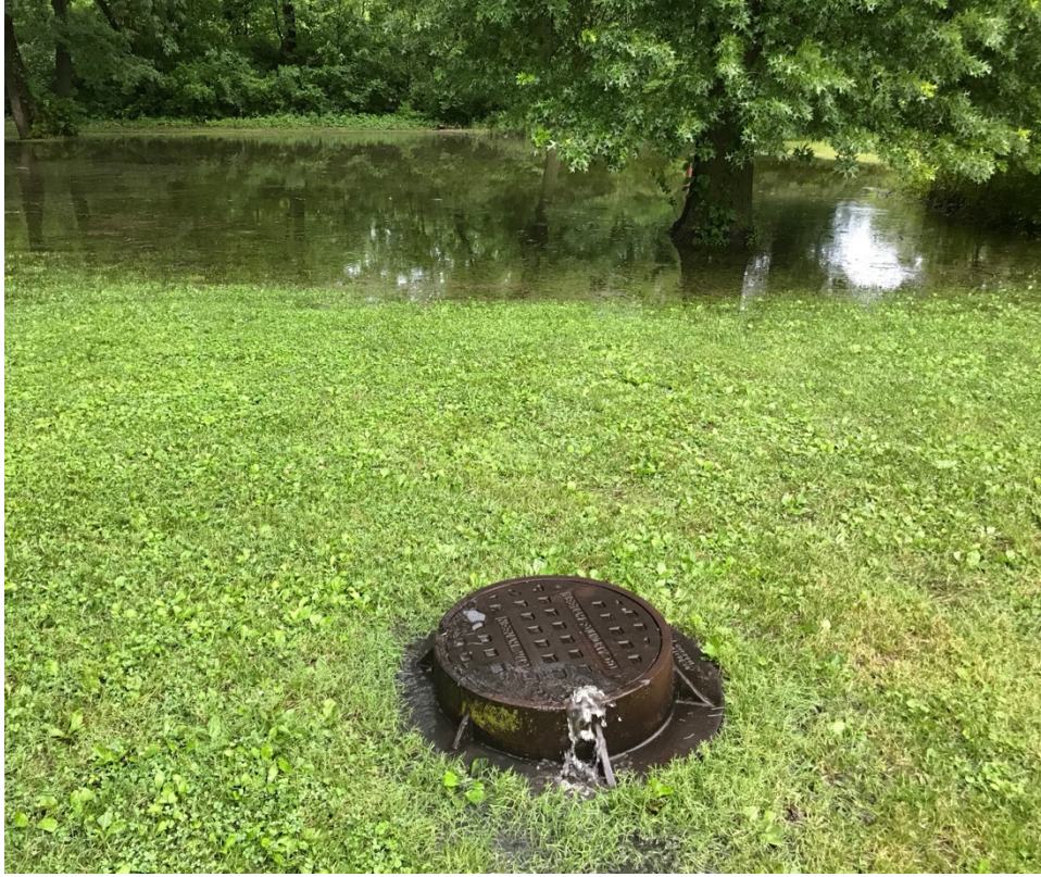
Figure 9: Manhole discharging sewage on June 30, 2020, near 466 North 73 rd St. in Centreville, Illinois.

211. Commonfields does not routinely inspect its system to identify SSOs, and often learns about SSOs from resident complaints or from employees if they happen to see an SSO. Commonfields does not document or report all SSOs, even though the Illinois EPA requires sewage system providers to notify the agency of SSOs within twenty-four (24) hours and to submit a written report to the agency within five (5) days.