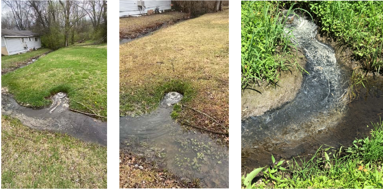
Figures 10-12: Dry weather sanitary sewer overflow at North 82 nd Street in Centreville, Illinois on March 30, 2021, January 26, 2021, and June 26, 2019, respectively, from left to right.

SSO is located in an otherwise peaceful neighborhood, where retirees, families, and children are forced to see and smell sewage. The discharge, as depicted in Figures 10-12, below, is a fast-flowing stream of sewage. At times, the SSO leaves a trail of toilet paper debris in the flow of the sewage stream.