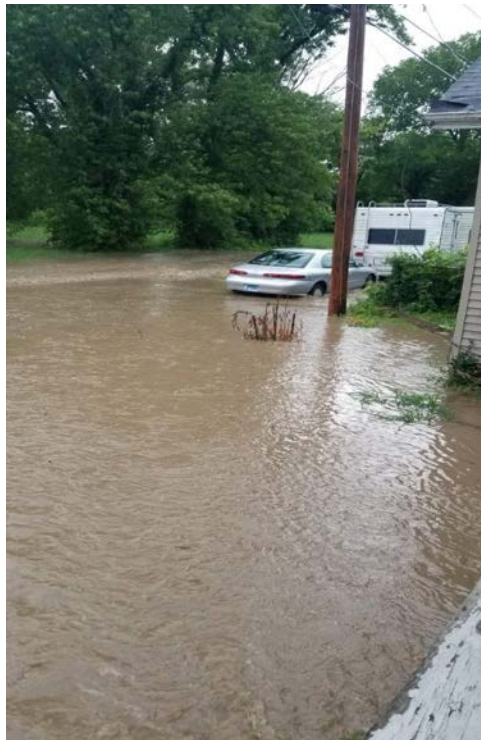
Figure 3: Flooding at the corner of [REDACTED] on June 30, 2020.

41. Mr. Goree’s home is situated at the corner of [REDACTED] where two (2) ditches controlled, owned, and within the jurisdiction of Cahokia Heights run parallel to each other. Instead of carrying water to a larger ditch, these ditches have remained clogged with mud, unmown grass, trash, and old pipes, lacking maintenance by Cahokia Heights for numerous years, allowing stormwater to flood the streets and Mr. Goree’s property and home. (See Figure 3).