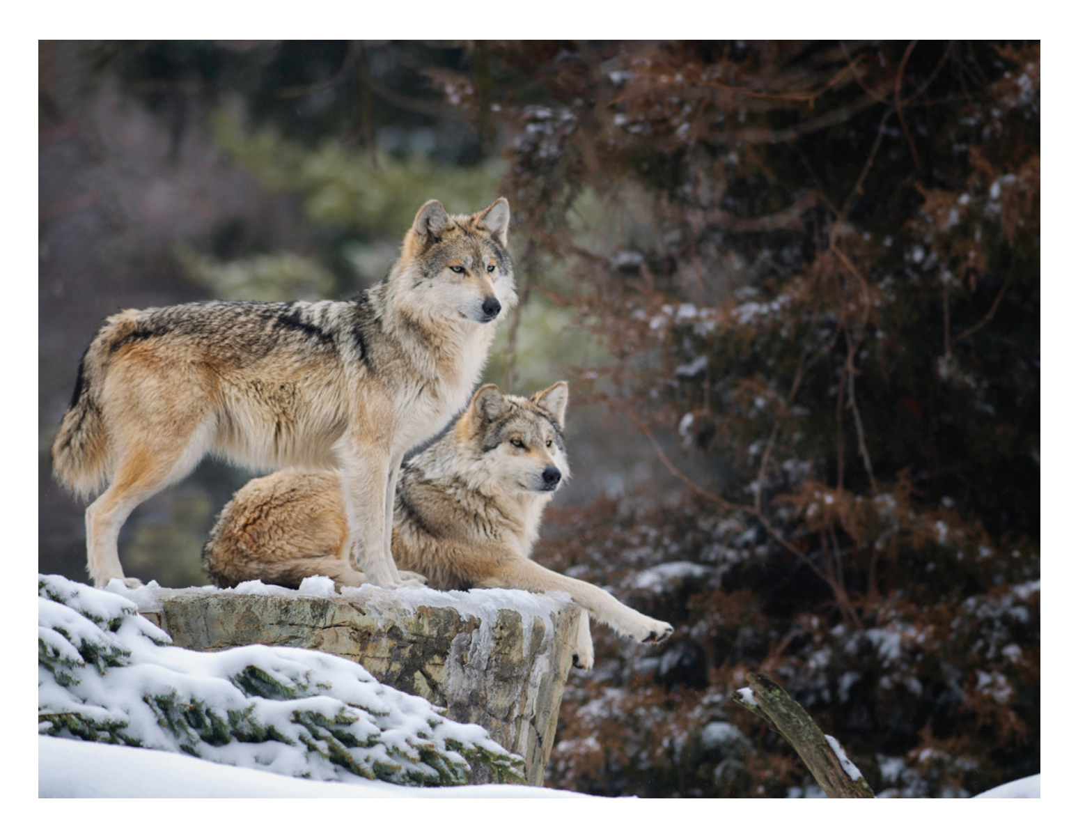
Mexican gray wolves—the "lobo" of frontier legend—once roamed the American Southwest..

In 2014, on behalf of a coalition of groups, Earthjustice sued the U.S. Fish and Wildlife Service to demand stronger protections for Mexican gray wolves—the "lobo" of Southwestern lore and one of the most endangered mammals in North America. Once reduced to only seven individuals in a captive breeding program, this wolf of Mexico and the U.S. Southwest was reintroduced into the wild in Arizona. Since then, the FWS has imposed numerous restrictions on the Mexican wolf recovery program and it has foundered, leaving an isolated population of just over 100 wolves plagued by inbreeding and excessive killings by humans. Our lawsuit aims to hold the agency accountable for failing to produce a valid recovery plan for