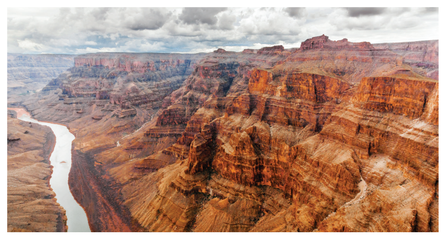
A proposed mega-development could threaten the Grand Canyon's water supply. (weltreisender.tj / Shutterstock)