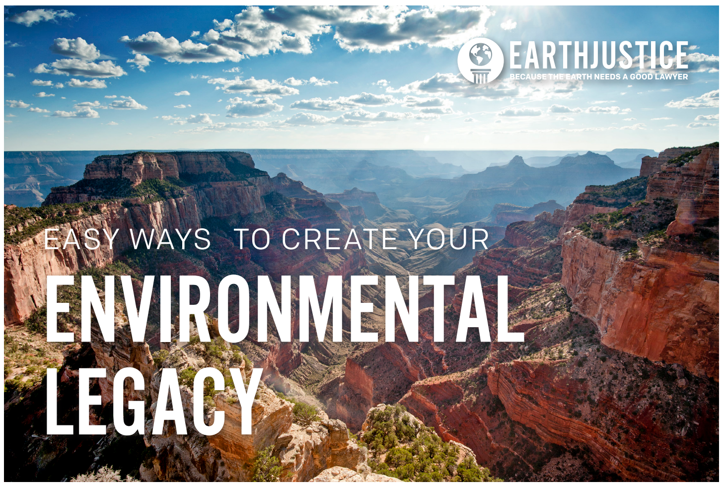
For years, Earthjustice has worked in the courts to keep development and mining companies from destroying iconic public lands, including the Grand Canyon.