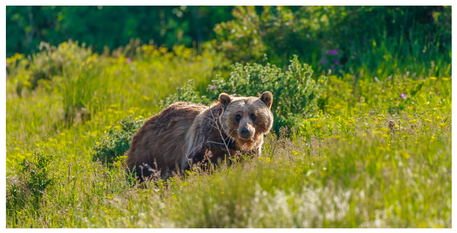
Earthjustice challenges any attempt to rollback the Endangered Species Act, a bedrock law which protects grizzlies, whales, wolves, and other imperiled wildlife.

Ensure your wishes are fulfilled instead of allowing an advisor to make the decision for you. To learn more, visit earthjustice.org/legacy/daf.