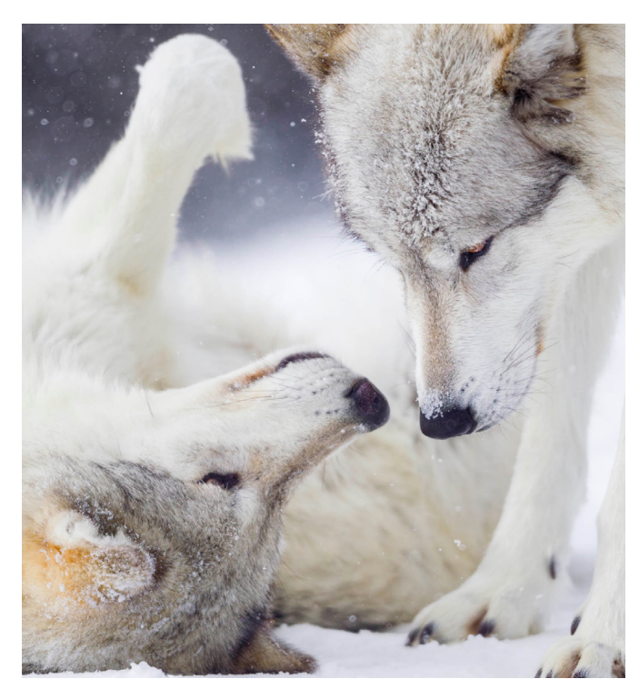
For decades, Earthjustice has kept gray wolves from the brink of extinction, fighting to prevent this iconic species from losing protection under the Endangered Species Act.

of beneficiary form from your plan provider and include Earthjustice as a full or partial beneficiary.