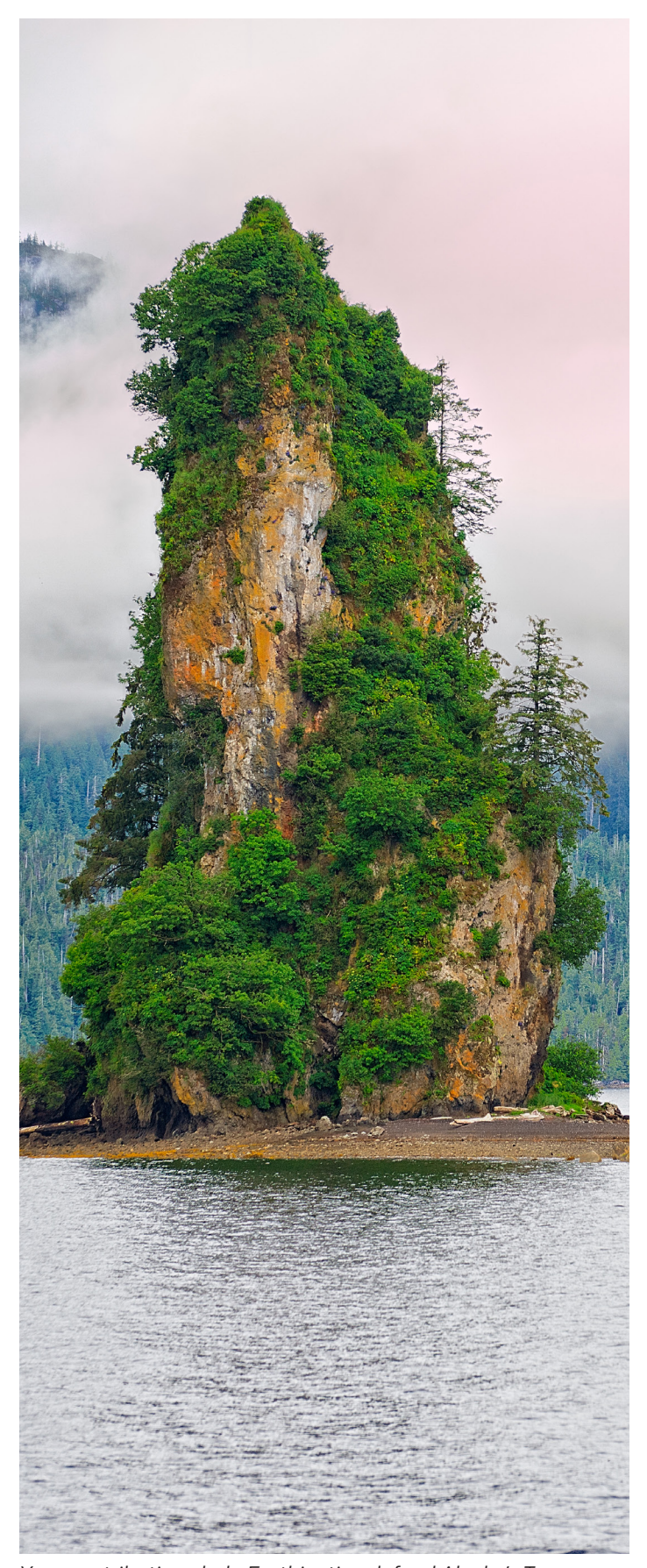
Your contributions help Earthjustice defend Alaska's Tongass National Forest from logging. Protecting these old-growth trees is critical in the fight against climate change.