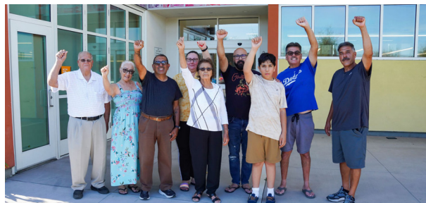
Members of Neighbors Against Phibro Tech.

DTSC is currently deciding whether to renew PTI’s draft permit and community members have strongly urged the department to prohibit PTI from continuing to operate in their neighborhood. PTI has shown itself to be a bad neighbor to the over 200,000 people who live within a three-mile radius of the facility, as can be seen with its repeated history of violations and dangerous incidents. And while the facility has been forced to take some preliminary steps to clean up the site, community members remain concerned about lingering contamination and the ability and willingness of DTSC to hold PTI accountable to its remedial obligations. By denying Phibro-Tech’s permit renewal, DTSC can prove to Los Nietos residents, and all Californians, that the department is a critical safeguard against industry’s toxic contamination.