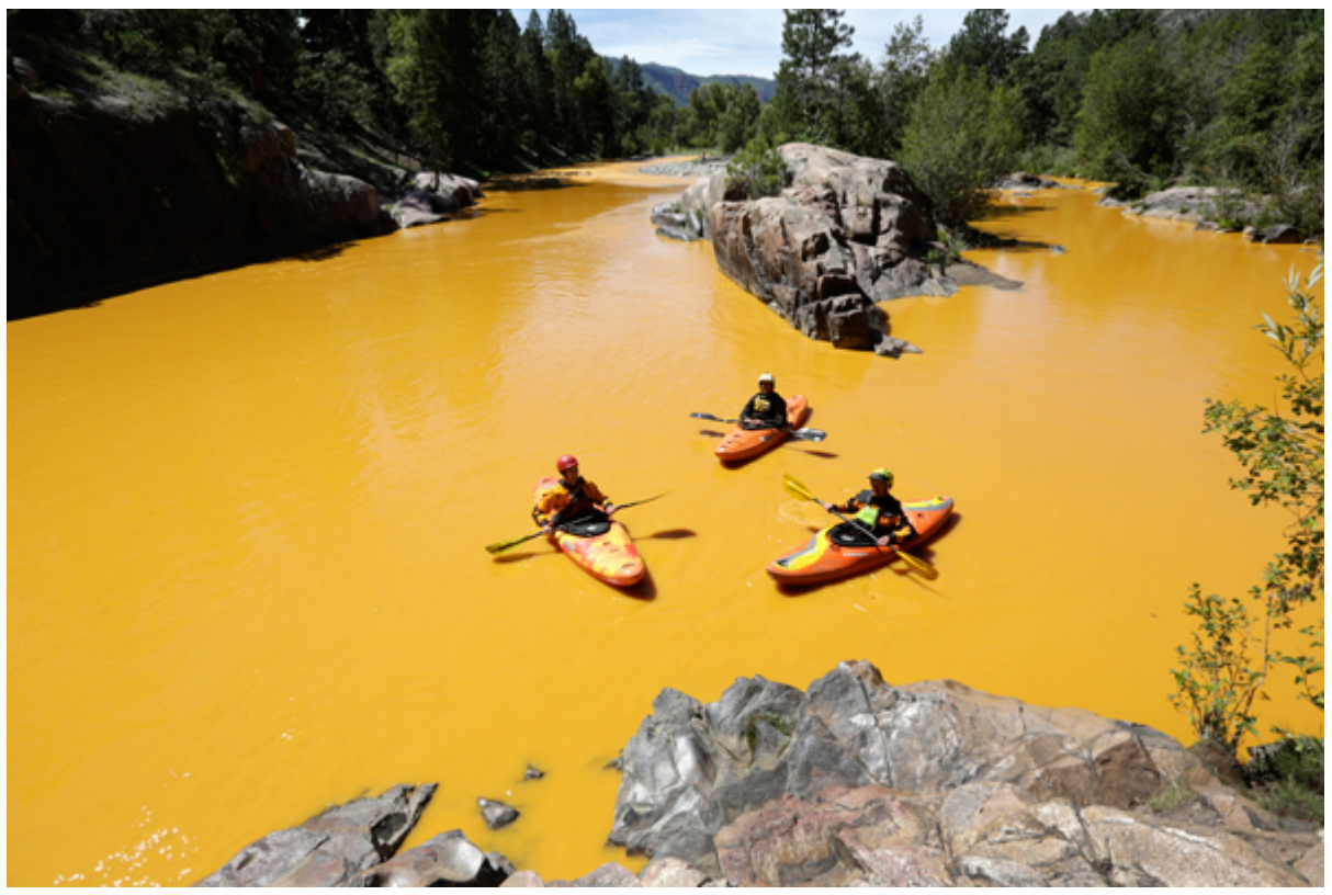
Kayakers find themselves surrounded by the toxic mine waste that flowed into Colorado's Animas River from the Gold King Mine in 2015.

As we do our work in D.C., we should do our work in collaboration and in partnership, in cohesion with states so that we can work on environmental issues from Superfund to air quality to water quality across the full spectrum in things that we do in partnership with those folks. That's the failure of the past administration. They saw them as adversaries and not partners.