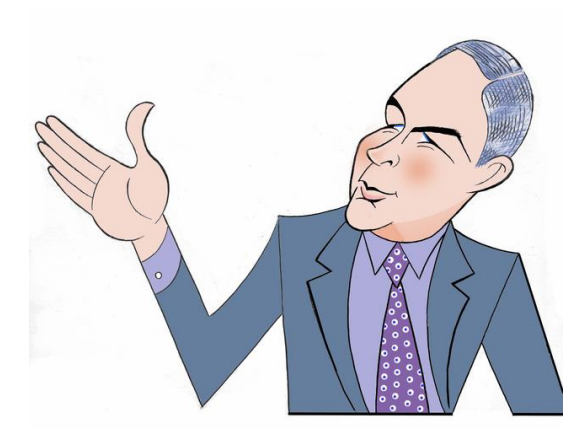
ILLUSTRATION: KEN FALLIN