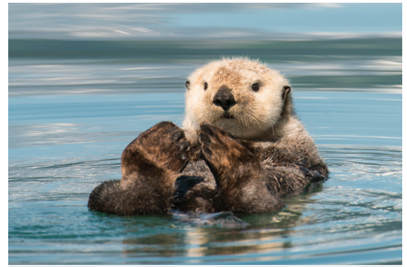
When fishing industry groups recently wanted to revive a harmful program that excluded otters from parts of their coastal habitat, Earthjustice fought back—and won.