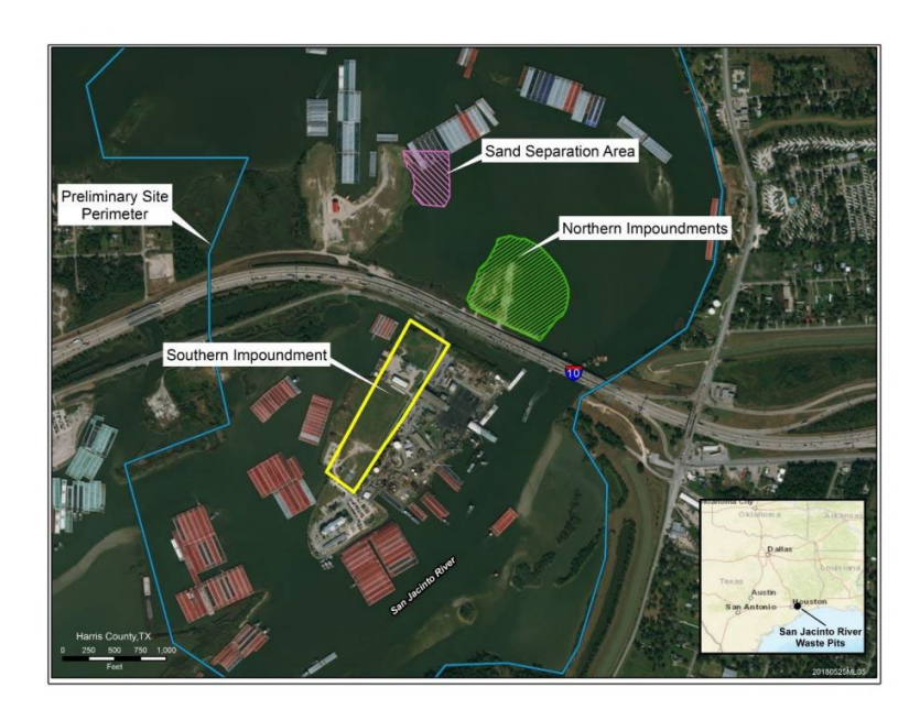
Figure 1 - Aerial map depicting the SJRWP Site. The site perimeter is outlined in blue, the northern impoundments in green, and the southern impoundments in yellow. 10