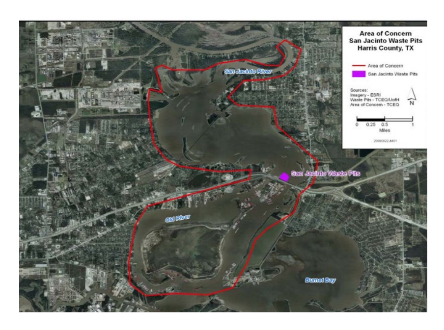
Figure 3 - Area of Concern: San Jacinto Waste Pits, Harris County, TX. See Permit Evaluation Requirement Process at 3, attached as Exhibit C.

95. The Area of Concern for the SJRWP Site includes the area south of longitude - 95.063977 and latitude 29.833028 and north of longitude -95.086488 and latitude 29.761463 as depicted by the red line in the map below: