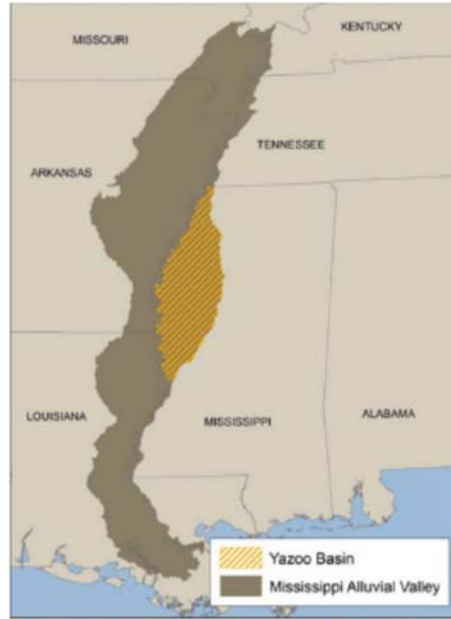
Figure 1: Location of the Yazoo Basin in northwestern Mississippi (Klimas et al. 2011:2)

68. Over the past 100 years, however, both flood control projects and land clearing for agriculture have eliminated approximately 80% of the bottomland forested wetlands in the Lower Mississippi River Alluvial Valley. These landscape scale changes have fundamentally altered wildlife habitat and reduced the biological diversity and integrity of this vital ecosystem.