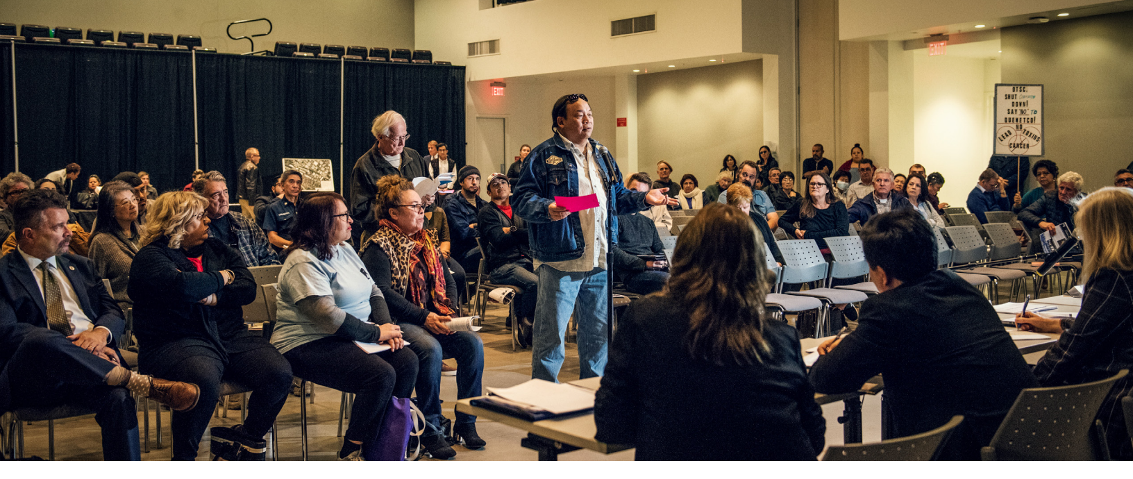
Community members at a local hearing to discuss Quemetco.

ceasing, day in and day out, for over 31 years ... The constant barrage of emissions causes acrid and offalic tastes, sore throats, headaches, nausea, coughing, and inhalation and respiratory problems ... I have reason to be concerned. My husband died in 1992 after suffering for three years from mouth and throat cancer."xvii