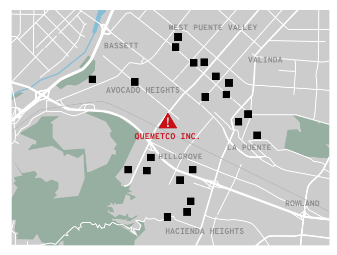
Figure 1: Schools within 2 miles of Quemetco

The population surrounding Quemetco is predominantly low-income and communities of color. Within a 3-mile radius of the facility, the population is 93 percent minority and per capita income is $22,266. VII According to CalEnviroScreen—a science-based mapping tool used by the California Environmental Protection Agency to identify census tracts that are disproportionately burdened by, and vulnerable to multiple sources of pollution—the communities surrounding Quemetco are in the 86th to 90th percentile. VIII A higher percentile indicates greater environmental burden and vulnerability. Communities that are in census tracts that score above the 75th percentile are identified as environmental justice communities.