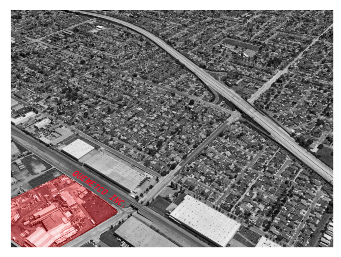
Figure 2: Proximity of Quemetco to nearby residents

The community members who live near Quemetco have repeatedly voiced their concerns about the facility to California's regulatory agencies, including DTSC and SCAQMD. For instance, in a 1996 letter to DTSC, a mother expressed her worries about Quemetco because her child (one year and eleven months old) had an elevated blood lead level of 12 µg/dL.x In a community questionnaire submitted that year, a teacher noted that her special education students had lead poisoning symptoms.xi In public meetings in 1996 and 2004 regarding Quemetco's application for a hazardous waste permit, community members expressed the same concerns that they continue to express at public meetings today. Residents at the public meeting in 1996 voiced concerns about their health and the health of family members and neighbors who were suffering from headaches, asthma, mental health issues, and cancer; and workers at a plant nearby expressed concern about Quemetco's