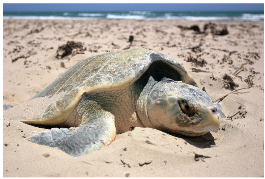
Figure 1. Kemp's ridley sea turtle.