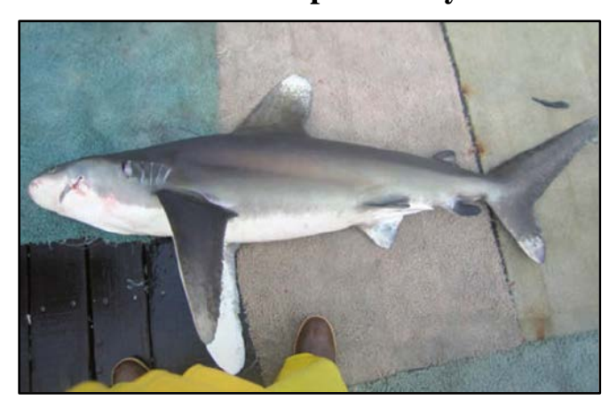
Oceanic whitetip shark bycatch

55. Many oceanic whitetip sharks caught as bycatch suffer at-vessel mortality. Capture on a longline is a stressful experience that can last hours because fishermen leave longline gear to soak in the water unattended for extended periods of time. For instance, in the Hawai'i shallow-set longline fishery, fishermen leave gear in the water for an average of 8–10 hours. Most sharks caught as bycatch tend to be hooked by longline gear, while others may become entangled in the lines as they attempt to escape, resulting in death if they are unable to circulate water through their gills. Even when these sharks manage to survive the initial capture and are released alive, they often sustain lasting damage from the physical trauma and extreme stress of being captured and many die after being released. Scientists have estimated that approximately 44 percent or more of oceanic whitetip sharks die after being captured and released as bycatch in the longline fleets.