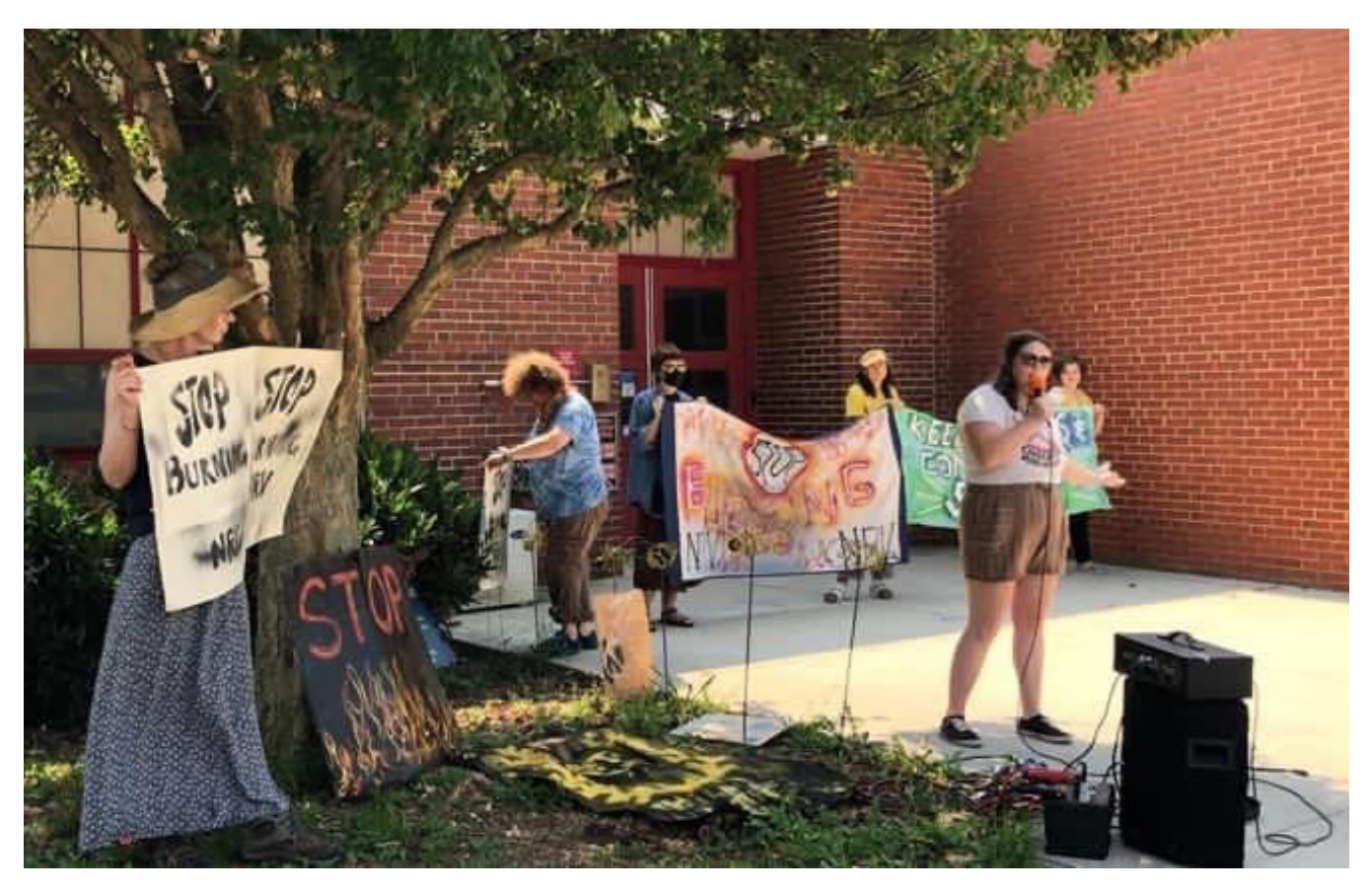
Citizens for Arsenal Accountability urging the end to open burning at RAAP.

RAAP is unfortunately not the only facility engaged in OB/OD in Virginia. There are two other facilities in the state: Naval Surface Warfare Center Dahlgren Division and NASA Wallops Flight Facility. Both of these facilities are Superfund sites due to the significant contamination that is present. For instance, operations at Dahlgren have led to contamination of the soil, groundwater, and sediment with numerous toxic chemicals, including arsenic, benzene, and lead, among others. At the NASA Wallops Flight Facility, the soil, groundwater, surface water, and sediment have been contaminated with polychlorinated biphenyls (PCBs), lead and other metals, volatile organic compounds, perchlorate, and per- and polyfluoroalkyl substances (PFAS).