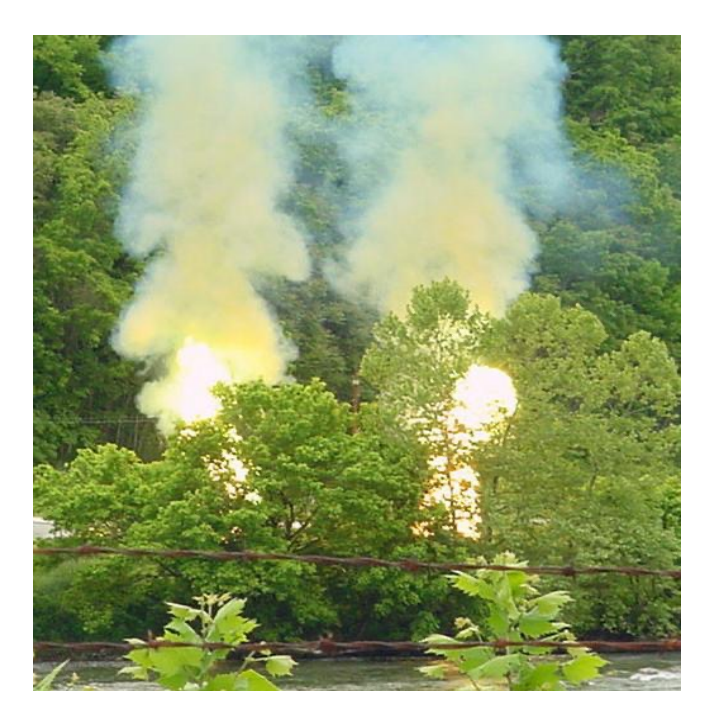
Open burning at RAAP.

new incinerator complex to treat many of the wastes that were typically open burned or burned in the old incinerators, VDEQ nevertheless has allowed the facility to continue open burning and using the old incinerators even when the new incinerator complex is constructed. Open burning should no longer be used at RAAP given the known dangers of this practice and the availability of safer alternatives; and the old incinerators should be closed given that they are outdated and thus pose more of a risk to community members and the environment.