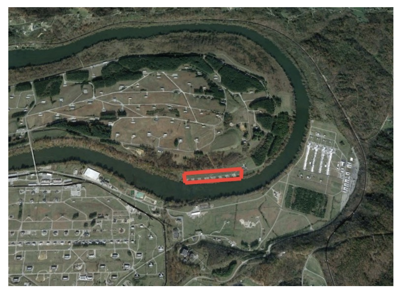
Open Burning Grounds at RAAP, located directly alongside the New River.

As shown in the figure above, RAAP is located within ten kilometers (or about six miles) of eight schools, eleven day-care centers, two hospitals, and three nursing homes. Children, hospital patients, and the elderly all may face an elevated risk of harm from exposure to pollutants emitted at the facility. According to the University of Massachusetts Amherst Political Economy