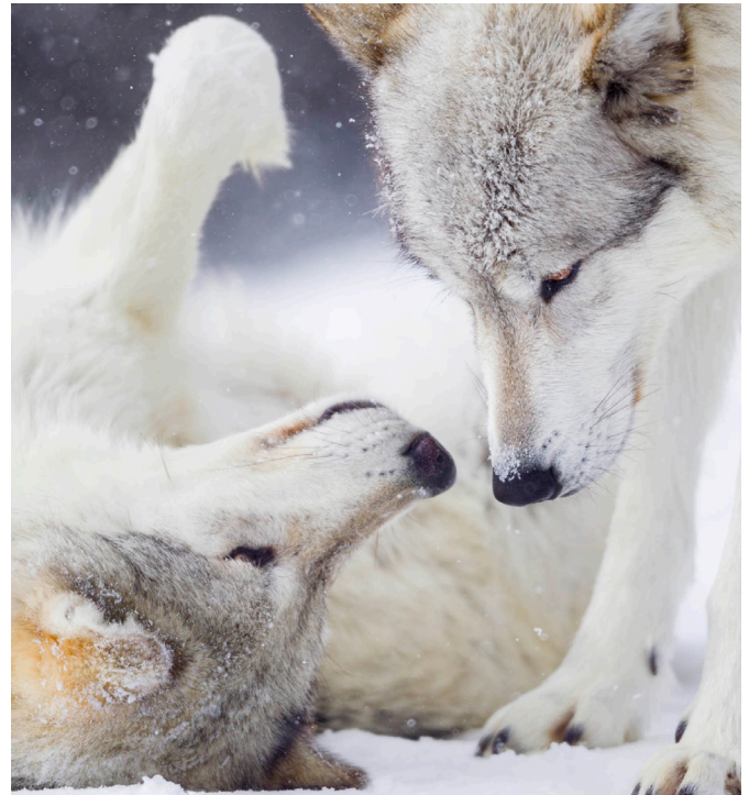
For decades, Earthjustice has kept gray wolves from the brink of extinction, fighting to prevent this iconic species from losing protection under the Endangered Species Act.

of beneficiary form from your plan provider and include Earthjustice as a full or partial beneficiary.