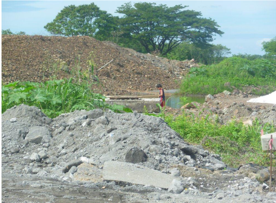
Child near coal ash that has been used as “fill” at Parque Gabriela II Housing Development, Puerto Rico.

describe above, they would have found that arsenic in coal ash is up to 250 times over the screening level.