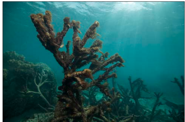
Algae covers dead coral after the bleaching event, May 2016.