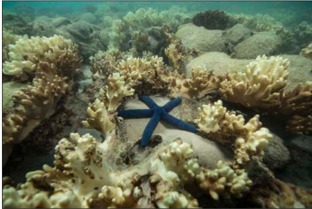
Sea star surrounded by decomposing coral, May 2016.