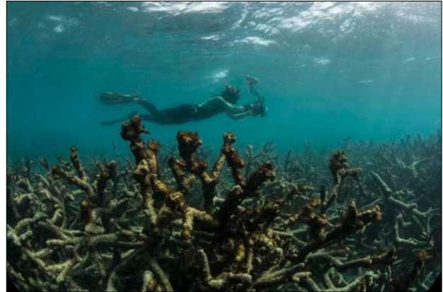
Documenting the dead coral after the bleaching event, May 2016.