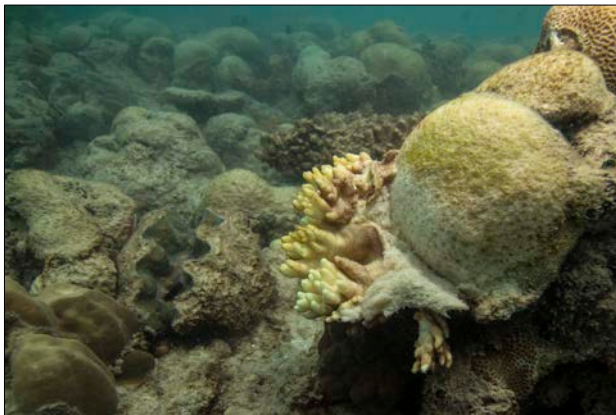
Decomposing soft coral falling off the reef, May 2016.