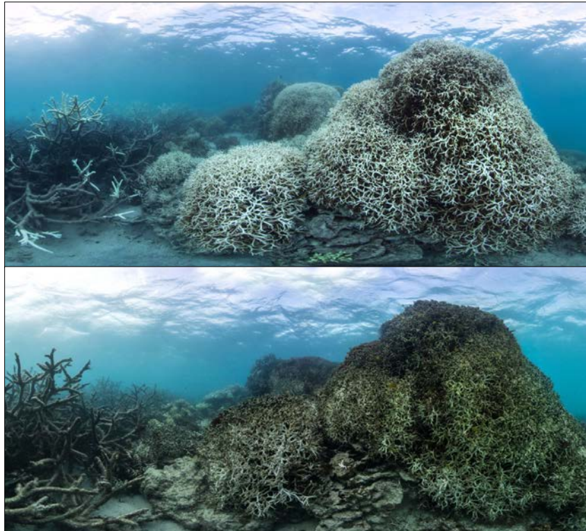
TOP: Coral bleaching at Lizard Island, Great Barrier Reef, March 2016.

The Great Barrier Reef, the world's largest coral reef, is a unique and irreplaceable part of Earth's natural heritage. One of the world's richest and most complex ecosystems, the Reef is home to innumerable species, including many found nowhere else on earth. As the World Heritage Committee has recognized, "No other World Heritage Property contains such biodiversity.... [The Great Barrier Reef] is of enormous scientific and intrinsic importance." 4