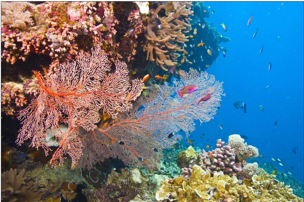
Healthy coral on the Great Barrier Reef.