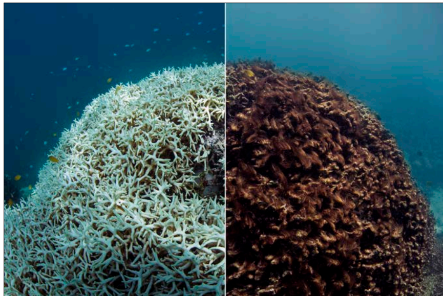
Coral bleaching, March 2016, and dead coral, May 2016.