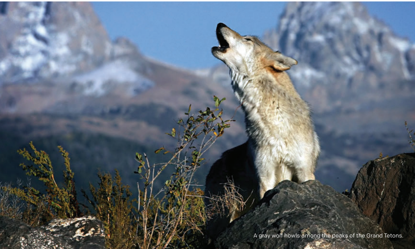
A gray wolf howls among the peaks of the Grand Tetons.