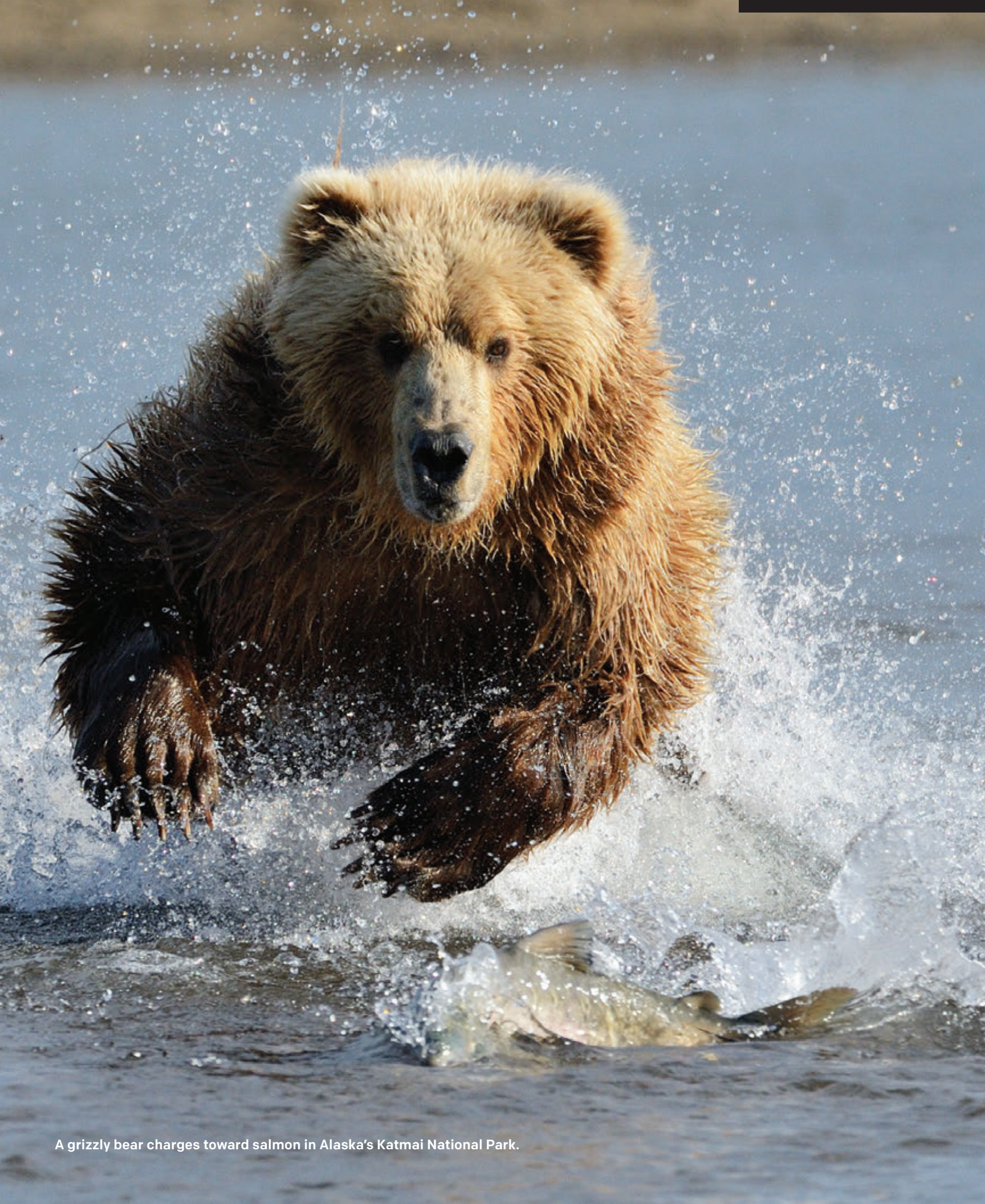
A grizzly bear charges toward salmon in Alaska's Katmai National Park.