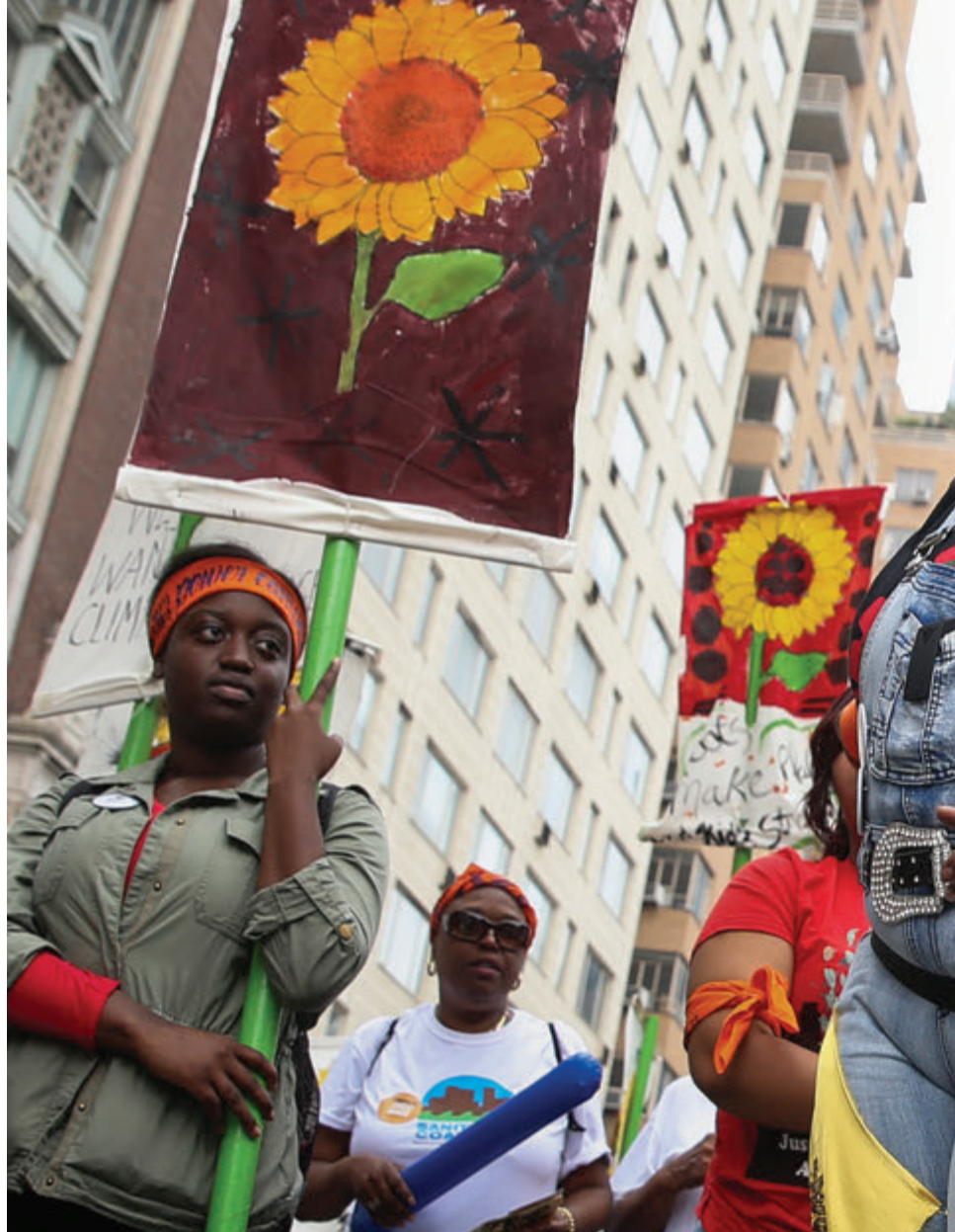
Top: Attendees at the People's Climate March in New York City on September 21 demand action on climate and air pollution. Top right: One-third of our food crops depend on bees and other pollinators.

Currently we're working with our coalition partners—including community justice and health advocates, faith groups, and tribes, as well as national health and environmental organizations—to keep the pressure on the EPA to finalize long-overdue standards to reduce emissions of cancer-causing pollutants from oil refineries, adopt health-protective standards for smog, and finally clean up the air in the dirtiest regions of the country.