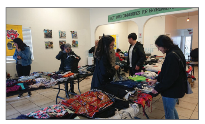
East Yard community clothing swap event.

This idea also ties directly to the push to require companies to take responsibility for the entire lifecycle of their products – often referred to as Extended Producer Responsibility (EPR) or Product Stewardship. This is a strategy "to place a shared responsibility for end-of-life product management on producers and all entities involved in the product chain, rather than making the consumer and local governments responsible."<sup>75</sup>