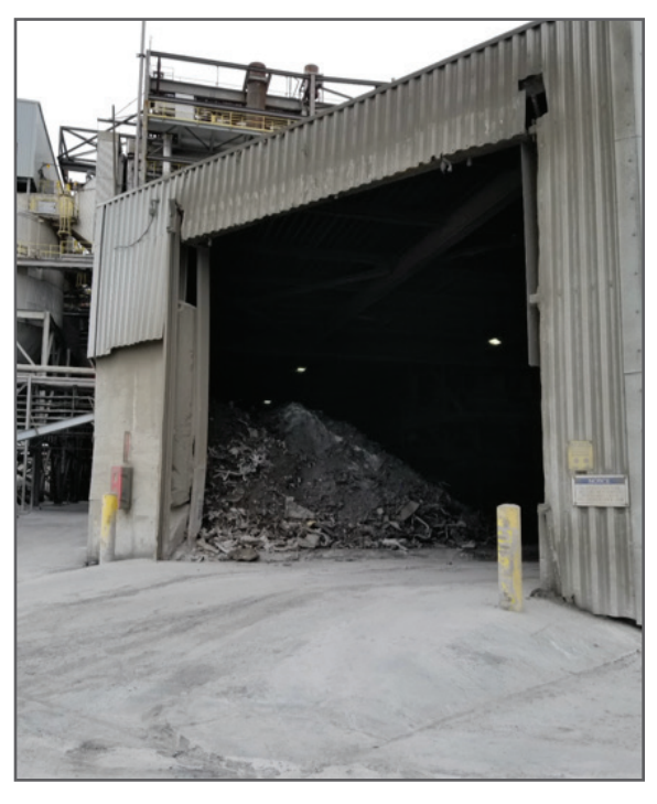
Image of the bottom ash building at SERRF (March 2018).

Further, inspections at SERRF have noted numerous instances of mismanagement of this ash. For instance, in March 2018, a CalRecycle inspector found an excessive