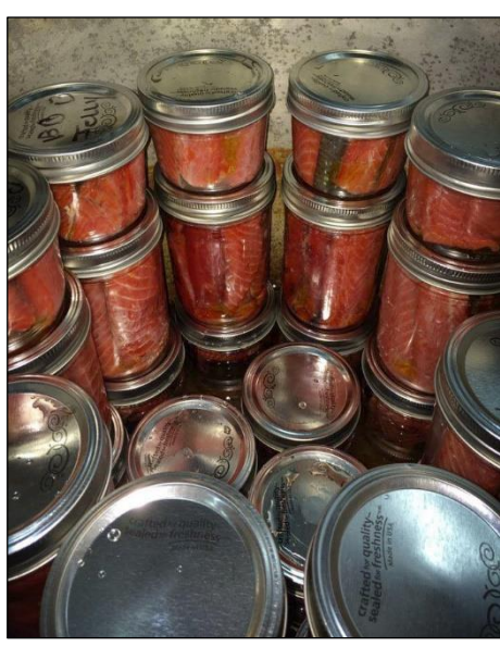
Canned smoked salmon.