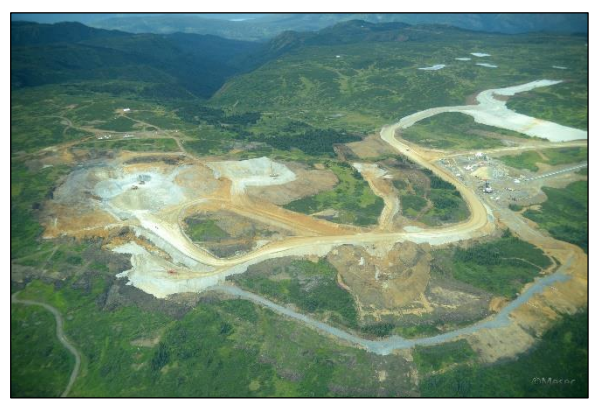
Red Chris Mine.