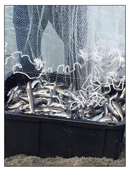
Hooligan from Stikine River are harvested with weighted nets.

sustain themselves through one winter and part of the next summer, his family