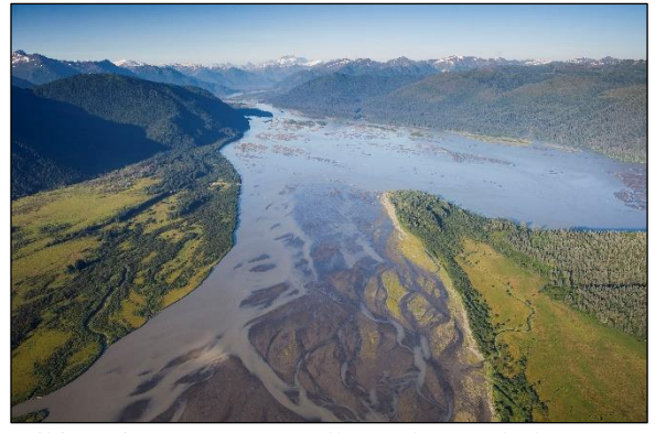
Stikine River near Wrangell, Southeast Alaska.

waters of the Stikine are inhabited by several species of fish, including all five species of Pacific salmon; steelhead, cutthroat, rainbow, bull, and lake trout; Dolly Varden; mountain whitefish; Arctic grayling; lake chub; longnose sucker; burbot, Pacific lamprey; slimy, prickly, and coast range sculpin; longfin smelt; eulachon; and threespine stickleback.<sup>13</sup> The Stikine River is one of the most important spawning rivers for Chinook salmon in Alaska.<sup>14</sup>