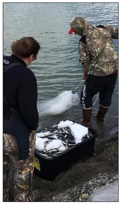
Hooligan from Stikine River are harvested with weighted nets.

Subsistence harvests on the Stikine River, including salmon fishing, are not only about economics. It is a traditional way of living that has been passed down to my children through several generations. My 92-year-old grandmother for example, told me stories about hanging salmon upon wood stakes. Fishing provides a center for social life in our community as well. I can remember many times when, after a productive day on the river, we would invite families together to process our catch together. When I was young, I did not speak much during these meetings, but rather sat and listened to the elders. I heard so many stories during these get-togethers, so important to my knowledge and identification with my community and culture. ... I have taught both of my daughters to fish, to smoke and can our harvests, and to ration harvesting and consumption sustainably. One day, I hope my grandchildren will also carry on these traditions.46