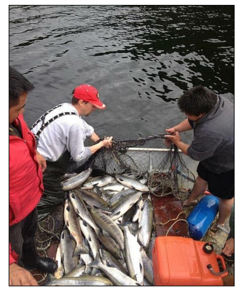
Subsistence sockeye salmon harvesting near Unuk River, Southeast Alaska.