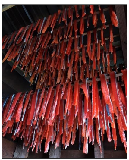
Salmon harvested from the Taku River.

Traditional subsistence harvest on the Taku is a way of life. It is central to our culture. ... I was taught to respect the river because it provided so much for us. We were taught never to mistreat the river and its watershed, always to leave it the way we found it. We never took anything more than we could use - fish, game, berries – and never wasted anything. Once I was on the river with a member of the US Forest Service. He asked me to point out sacred sites on the Taku River. I told him that this whole place is sacred. I imagine that all twenty tribal governments in Southeast Alaska share that feeling.<sup>42</sup>