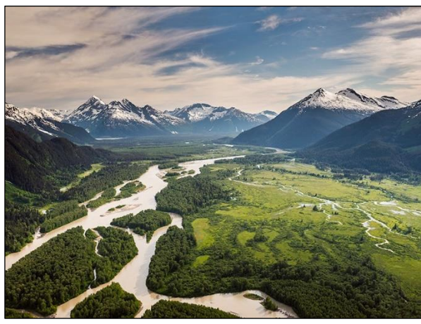
View of the Tulsequah River, looking east towards the confluence with Taku River.

1. Southeast Alaska Native communities have depended for millennia upon the pristine transboundary watersheds of the Taku, Stikine, and Unuk rivers. These rivers flow through varied and wild landscapes from British Columbia through Alaska to the Pacific Ocean. These watersheds are teeming with biodiversity, including dozens of species of fish, many of which – particularly salmon and eulachon – have been historical staple commodities for Native communities, and remain centerpieces of their cultural practices and spiritual beliefs.