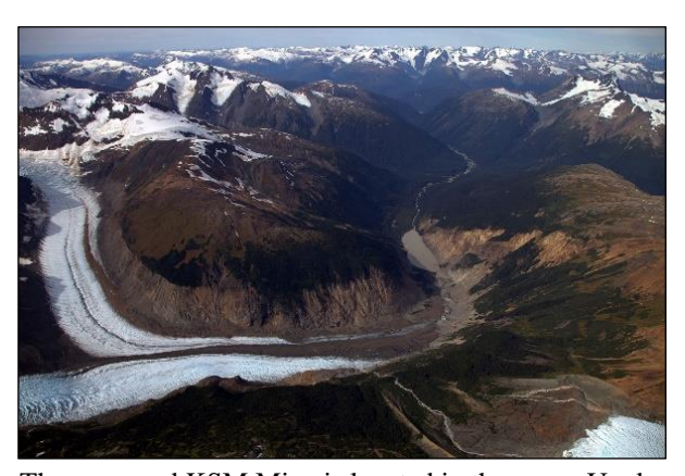
The proposed KSM Mine is located in the upper Unuk River watershed. Photo used with permission

114. Seabridge plans to divert water that has contacted disturbed areas or materials to a 63-hectare water storage facility<sup>262</sup> in a dammed section of Mitchell Creek.<sup>263</sup> From there, it will be pumped to the water-treatment plant<sup>264</sup> to be treated with lime before being released into Sulphurets Creek, which flows into the Unuk River.<sup>265</sup> Seabridge claims that the water treatment and water storage facilities will continue to operate after closure of the mine "until discharge quality meets targets," a period expected to be around 250 years.<sup>266</sup> The company estimates post-closure treatment costs to be $20,383,500 per year for basic treatment, and $6,656,620 for the selenium treatment plant.<sup>267</sup> These costs do