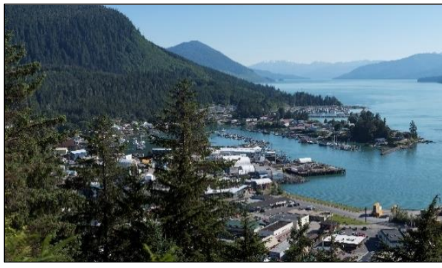
and boat, no supplies could come into Wrangell through normal commercial networks. Wrangell, home of Wrangell Cooperative Association, sits near the mouth of Stikine River in Southeast Alaska. The grocery shelves emptied in hours, and our community was reminded of the importance of our relationship with the land. 39

Our traditional harvesting practices are important to our livelihood, and to safeguarding our family's welfare, especially given Wrangell's location off of the continental road system. For example, I remember on September 11, 2001, when traffic was halted by plane and boat, no supplies could come into Wrangell through normal commercial networks.