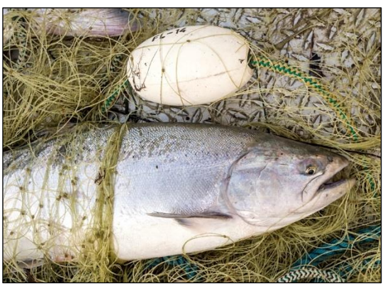
Taku River salmon.

they harvest. Moreover, as discussed below, despite the threats these mines pose, British Columbia and Canada are unlikely to prevent the harm they are causing.