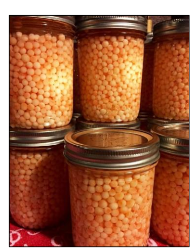
Jarred Unuk River salmon eggs.

131. Unlike other metals, the toxic effects of selenium occur primarily through dietary as opposed to waterborne pathways. 305 Unlike most trace elements, selenium bioaccumulates (accumulates in the body faster than the body can process or excrete it) and sometimes biomagnifies (becomes more highly concentrated in animal tissue at successively higher levels of the food chain). 306 Since diet is the primary source of selenium to fish, its efficient uptake by algae and macroinvertebrates contributes to selenium toxicity. 307 Thus, relatively low selenium concentrations can lead to fish toxicity via bioaccumulation. 308 Although adult fish are relatively tolerant of selenium, bioaccumulation allows it to be deposited into eggs during their formation, resulting in deformations, typically in the fishes' skeleton, skull, or fins. 309