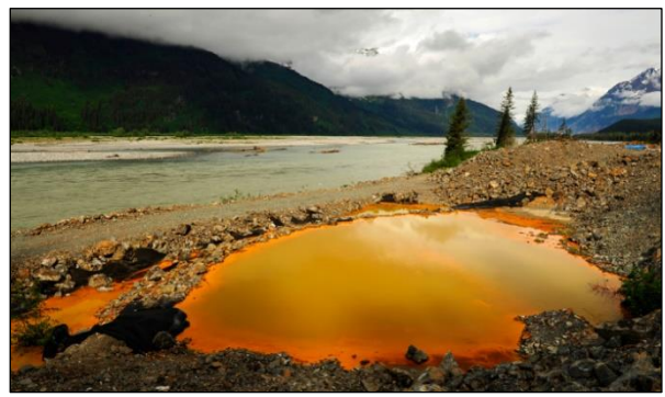
Acid Mine Drainage from the old Tulsequah Mine collects in a retaining pond adjacent to the Tulsequah River.

55. The difficulty of containing acid mine drainage over decades is evident in the case of the old Tulsequah Chief Mine in British Columbia. Although the mine, located at the same site as one of the proposed B.C. Mines, ceased operations in 1957, toxic acid mine drainage from the mine has polluted the watershed since its closure. 80 A 2016 study commissioned by the government of British Columbia found that "multiple undiluted and untreated sources of historic mine waste are