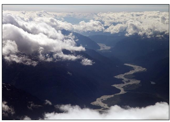
Upper Unuk River, British Columbia, Canada.

28. Around 80 miles (129 kilometers) long, the Unuk River drains a watershed of 1,500 square miles (3,885 square kilometers). From its headwaters in a heavily glaciated area in British Columbia, south of the lower Iskut River, the Unuk flows west and south, crossing into Alaska and emptying into Burroughs Bay, an inlet of Behm Canal. Despite its relatively small size, the watershed is a place of important biodiversity. The river teems with fish, including eulachon; steelhead, rainbow, bull and cutthroat trout; all five North American species of Pacific salmon; and mountain whitefish. 21